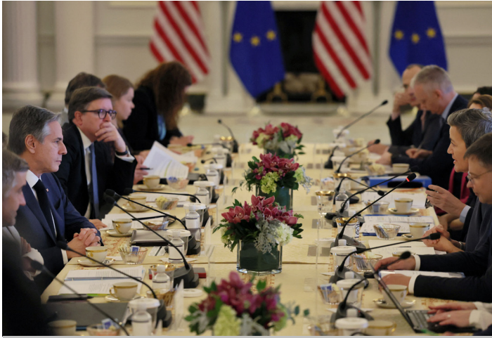
US and EU officials speak at a meeting of the US-EU Trade and Technology Council in Washington, DC, January 30, 2024.

the company's previously localized data to leave the country. 38 In addition, the government of Germany is trying to ease the passage of data to and from China on behalf of German carmakers. On April 16, several German government ministers, part of a delegation visiting China led by Chancellor Olaf Scholz, issued a joint political statement with Chinese counterparts promising “concrete progress on the topic of reciprocal data transfer—and this in respect of national and EU data law,” with data from connected cars and automated driving in mind. 39