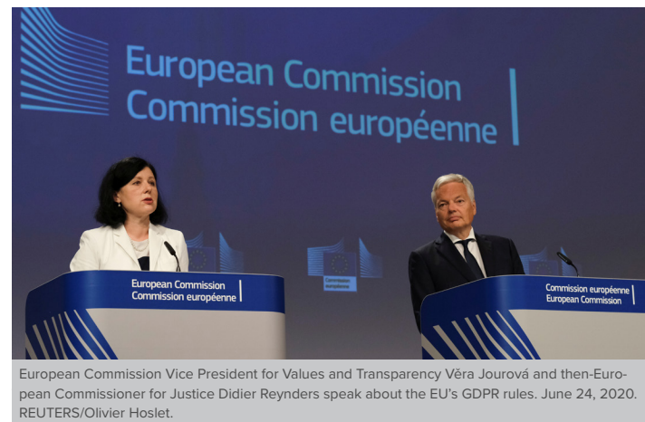
European Commission Vice President for Values and Transparency Věra Jourová and then-European Commissioner for Justice Didier Reynders speak about the EU's GDPR rules. June 24, 2020.