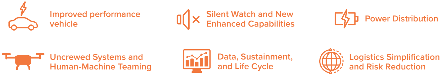
Figure 1. Operational Advantages and Efficiencies of Electrification of Military Vehicle Fleets, Especially the US Army's TWV Fleet