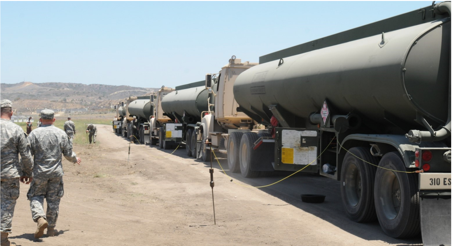
Fuel Truck Convoy. Fossil fuel powered vehicles necessitate large, and highly vulnerable, fuel logistics convoys. A shift to electrified vehicles could reduce this issue.

a Delfast bike with one soldier holding a Next-generation Light Anti-Tank Weapon (NLAW). 3