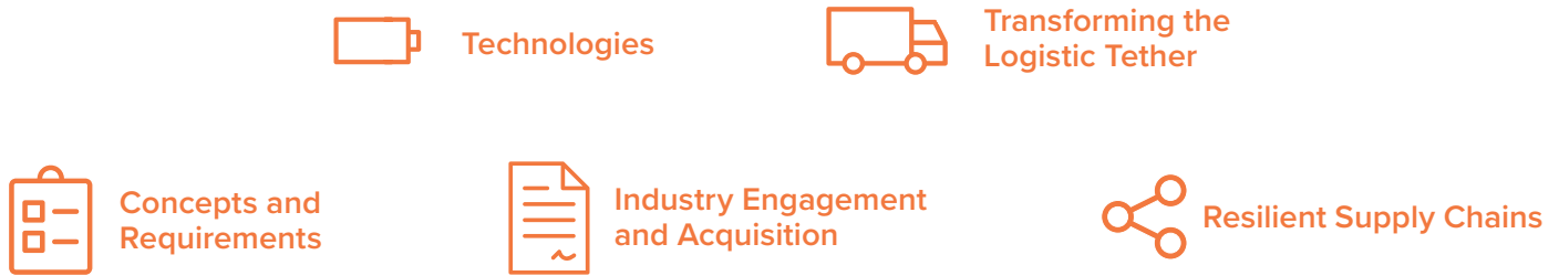
Figure 2. Five Challenges to Speeding Up Development and Adoption of EVs in the US Military