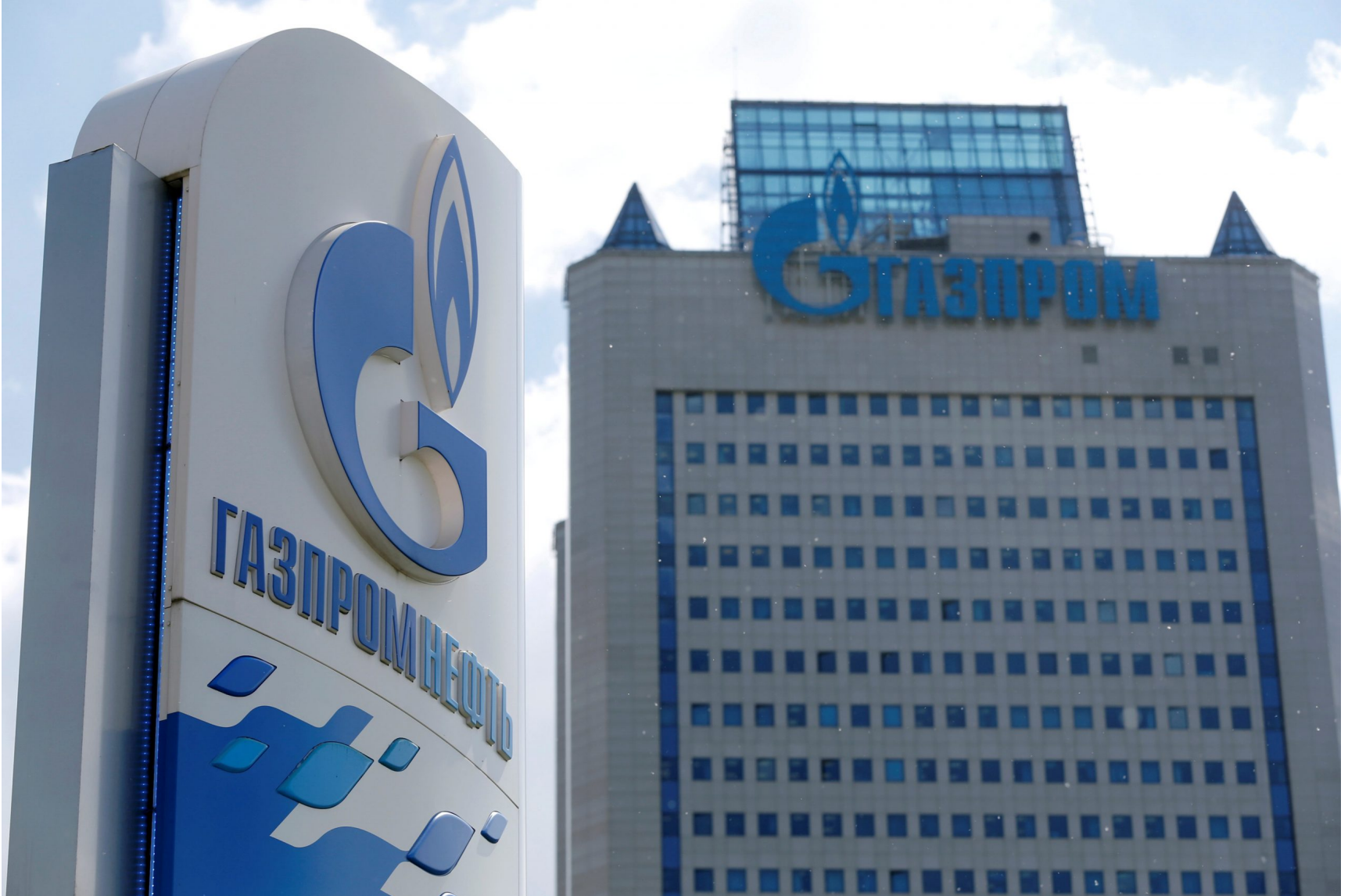
A board with the logo of Gazprom Neft oil company is seen at a fuel station in Moscow, Russia, May 30, 2016.

Three years later, the EU moved to create a unified energy market that, among other things, sought to relieve some members' reliance on outside suppliers. An EU press release noted that six EU countries—Bulgaria, Estonia, Finland, Latvia, Lithuania, and Slovakia—depended on a single external supplier for all their gas imports. 39 All but Finland had suffered multiple politically motivated supply cuts. 40