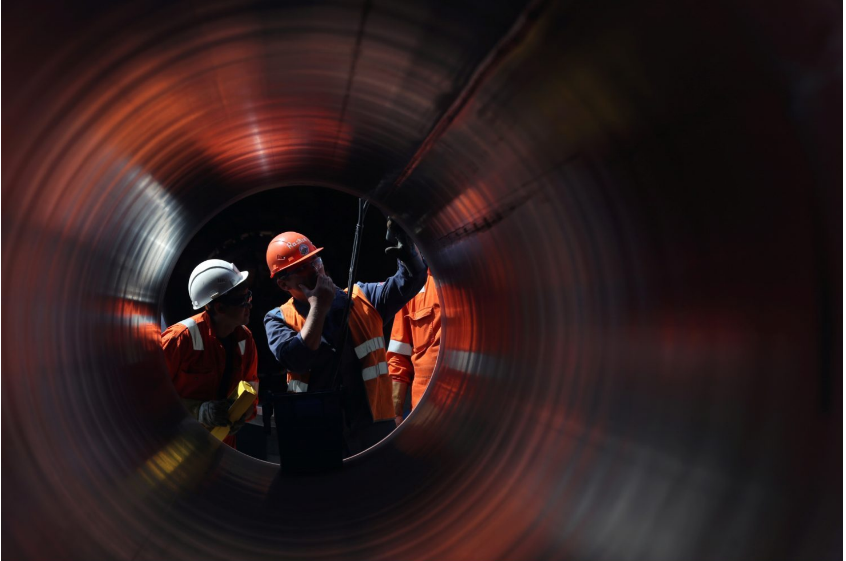
Workers are seen through a pipe at the construction site of the Nord Stream 2 gas pipeline, near the town of Kingisepp, Leningrad region, Russia, June 5, 2019.

As it sinks billions of dollars into these projects, Gazprom faces challenges from pipeline competitors. The Trans Adriatic Pipeline (10 bcm), for example, will carry gas from a pipeline in Turkey to southern Italy when it opens in 2020. It is backed by BP, Azerbaijan's SOCAR, Italy's Snam, Belgium's Fluxys, Enagás in Spain, and Axpo in Switzerland. In Russia's other neighborhood, a 55 bcm pipeline carries gas from Turkmenistan to China, giving both countries an alternative to Russia for their exports and imports, respectively.