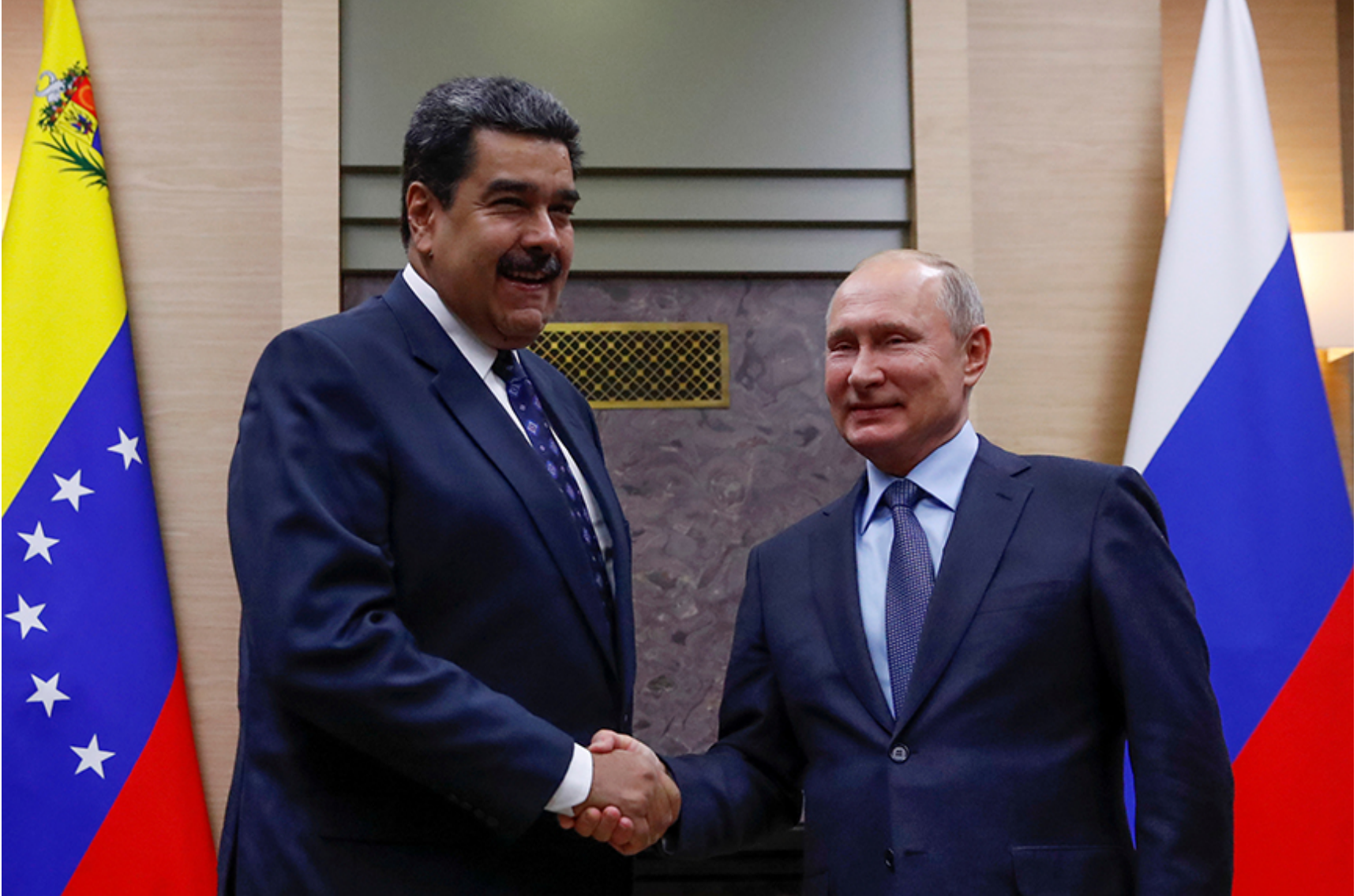
Russian President Vladimir Putin (right) shook hands with his Venezuelan counterpart, Nicolás Maduro, at the Novo-Ogaryovo state residence outside Moscow, Russia, on December 5, 2018.

Then in December 2019, the US Congress inserted sanctions against the Nord Stream 2 pipeline into the must-pass defense bill. US President Donald J. Trump signed the bill, and the Swiss company that had been laying the pipe in deep water halted its work instantly, leaving the pipeline incomplete for the time being.