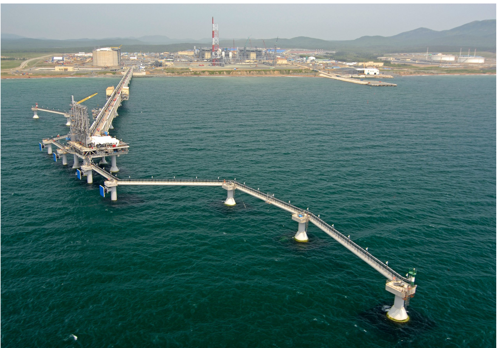
Prigorodnoye production complex, Sakhalin II project.