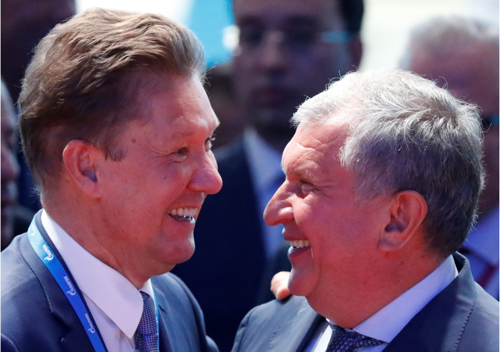
Gazprom Chief Executive Alexei Miller and Rosneft Chief Executive Igor Sechin react as they wait before a session of the Eastern Economic Forum in Vladivostok, Russia September 7, 2017.