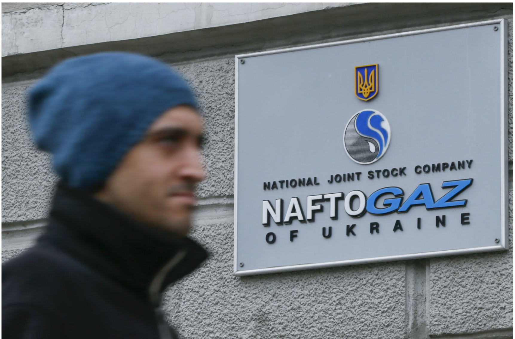
A man walks past the headquarters of the Ukrainian national joint stock company NaftoGaz in central Kyiv, Ukraine, March 15, 2016.

Later, Naftogaz won a net award of $2.6 billion in a case that claimed Gazprom had underpaid for gas transit through Ukraine, but Gazprom refused to pay. 53 Naftogaz responded by calling for a freeze on Gazprom assets in several European countries on the basis of the New York 1958 Convention on Recognition and Enforcement of Foreign Arbitral Awards. In December 2019, Gazprom relented and paid Naftogaz $2.9 billion to settle the case and to get Naftogaz to drop other litigation. 54 This case shows the strength of international arbitration. Although Russia initially loudly declared that it would not pay Ukraine after Naftogaz had large Gazprom assets frozen abroad, Gazprom swiftly relented and quietly paid the whole amount in cash.