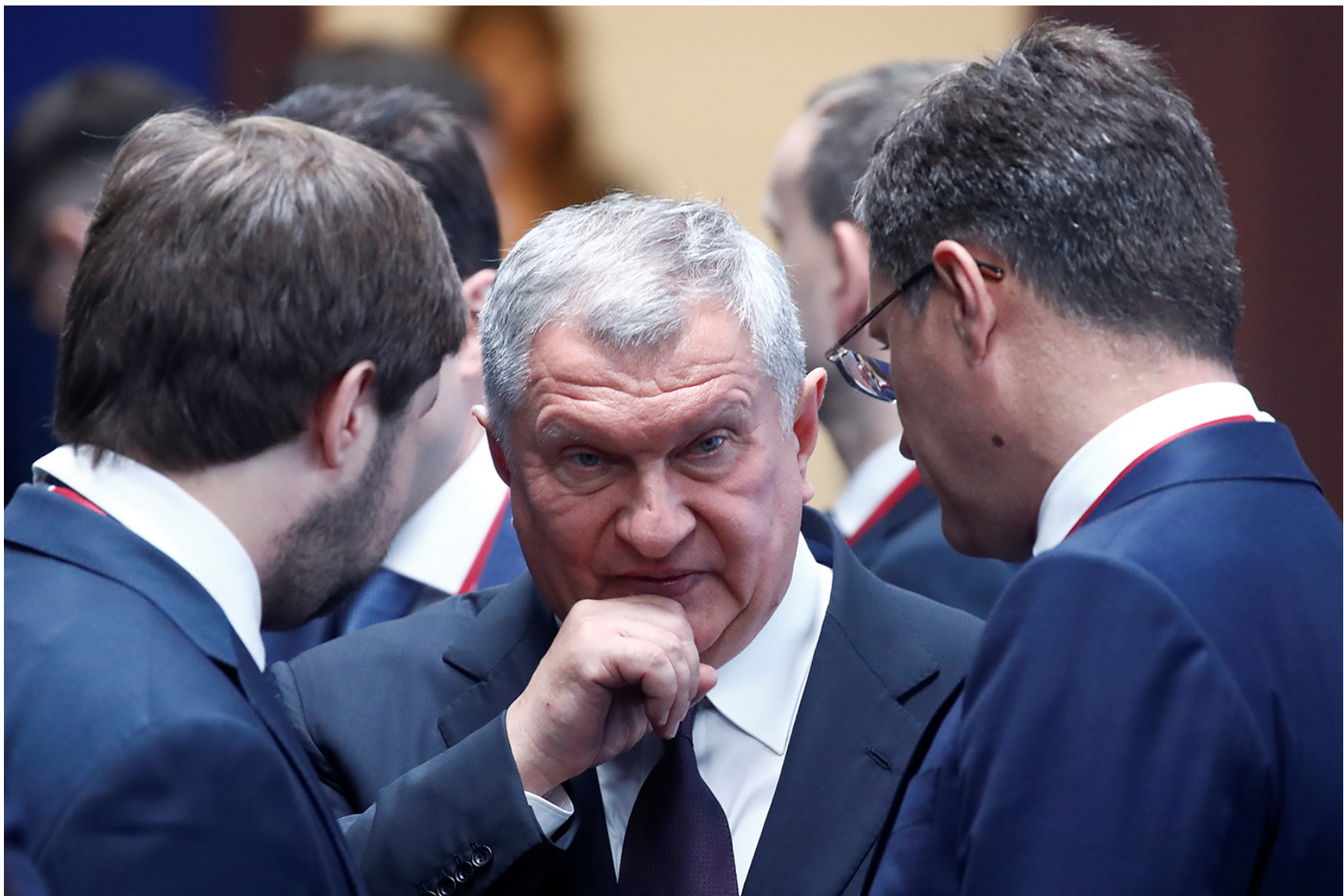
Chief Executive of Rosneft Igor Sechin (C) and Russian Energy Minister Alexander Novak (R) attend a Russian-Chinese business forum on the sidelines of the St. Petersburg International Economic Forum (SPIEF), Russia June 7, 2019.

Lucky for Russia, it has a bigger rainy-day fund and is more self-sufficient than before the sanctions were applied. But either way, in the long term, the country's GDP growth and foreign trade surplus will continue to overly rely on oil and gas. When oil prices were high, oil and gas accounted for two-thirds of the value of Russia's exports.