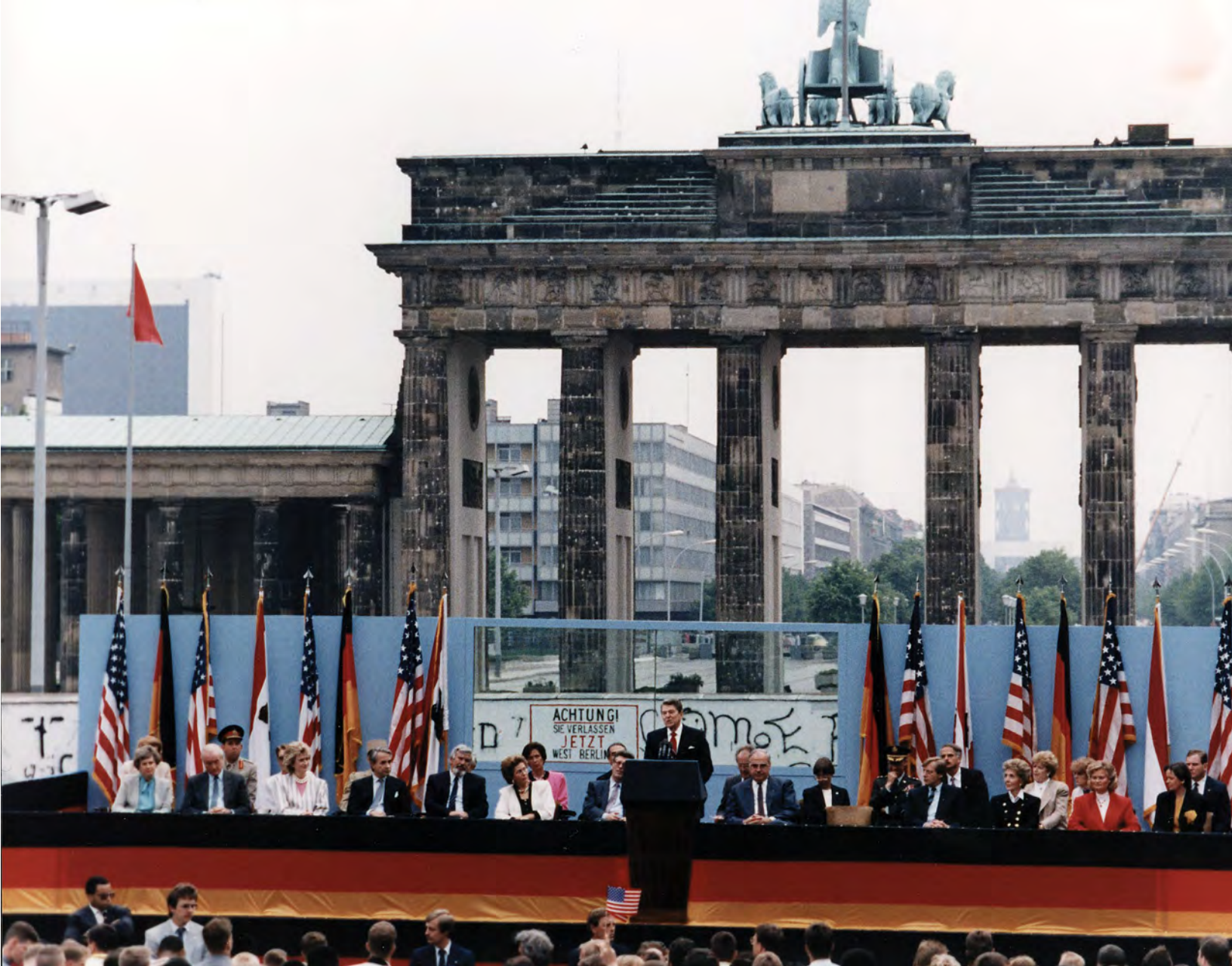
US President Ronald Reagan speaks in West Berlin in front of the Brandenburg Gate on June 12, 1987.

partitioned Central and Eastern Europe with Nazi Germany, and the Second World War was on.