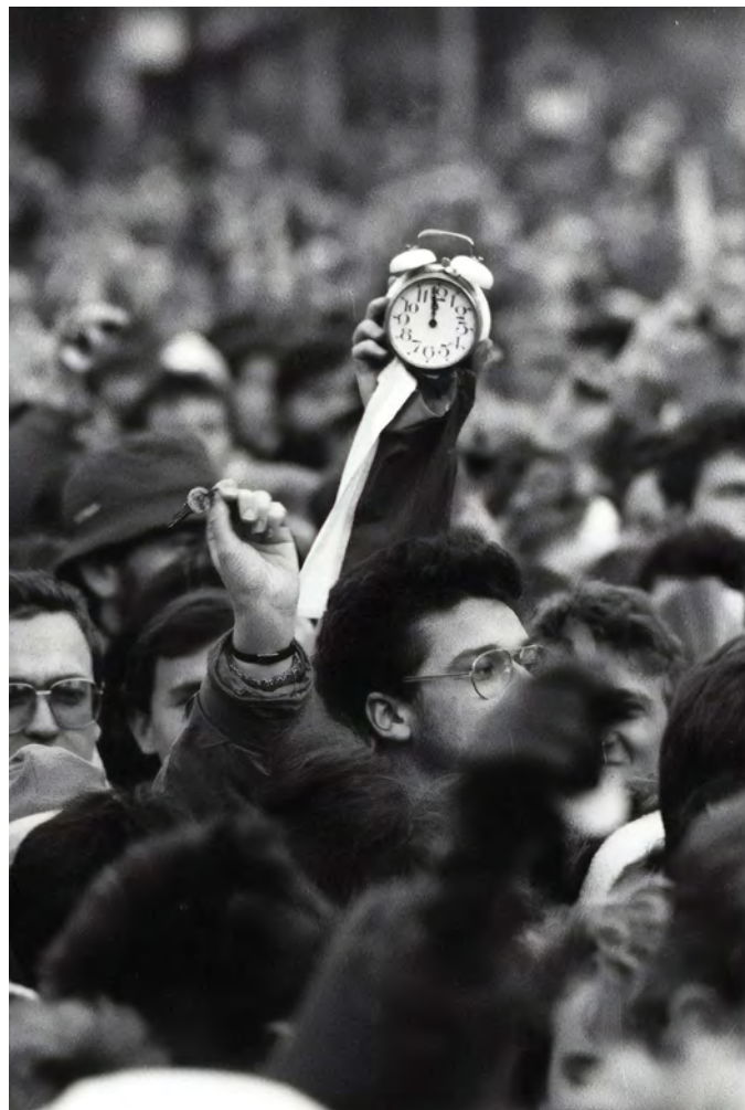
People display keys and a clock during the Velvet Revolution in the Slovak National Uprising Square in Bratislava, November 1989.

Happily, the Trump administration has not acted on the most extreme elements of its rhetoric. Under President Trump, the United States has built on the Barack Obama administration’s support for strengthening defense of NATO territory against potential Russian aggression, including through US rotational deployments to Poland and support for UK, German, and Canadian-led NATO battlegroups in the Baltics, and by encouraging Europeans to invest more in NATO (while President Trump’s rhetoric can be seen as anti-NATO, his recommendation for more defense spending would strengthen it). The United States has at least started to work through trade issues with the EU Commission, and has maintained US-EU sanctions against Russia for its aggression against Ukraine. The administration’s National Security Strategy, produced under the leadership of former National Security Advisor H.R. McMaster, makes a credible case that the world has re-entered a period of great-power competition (in terms of Russia and China), and suggests that alliance with Europe