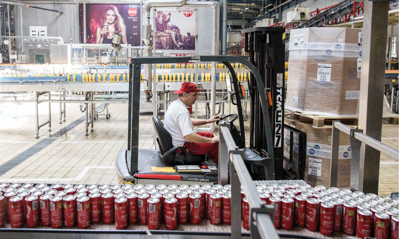
A worker moves packaged boxes of drink as aluminium cans of Coke soda move along the automated production line at the Coca-Cola Hbc Magyarorszag Kft plant in Dunaharaszti, Hungary, on Thursday, July 13, 2017.

This has brought enormous benefit to Central Europe, along with new challenges. One such challenge comes from an EU coping with Brexit and other internal issues. EU structural funds available for Central Europe have spurred development (as they did for Spain and other earlier EU entrants), but economic infrastructure in Central Europe remains far behind that in Western Europe, and EU structural and other funds are likely to drop in the mid-term, as Brexit may put downward pressure on the EU budget. Freedom of movement within the European Union has opened opportunities for young people from Central Europe, but also exacerbated a brain drain of talented youth.