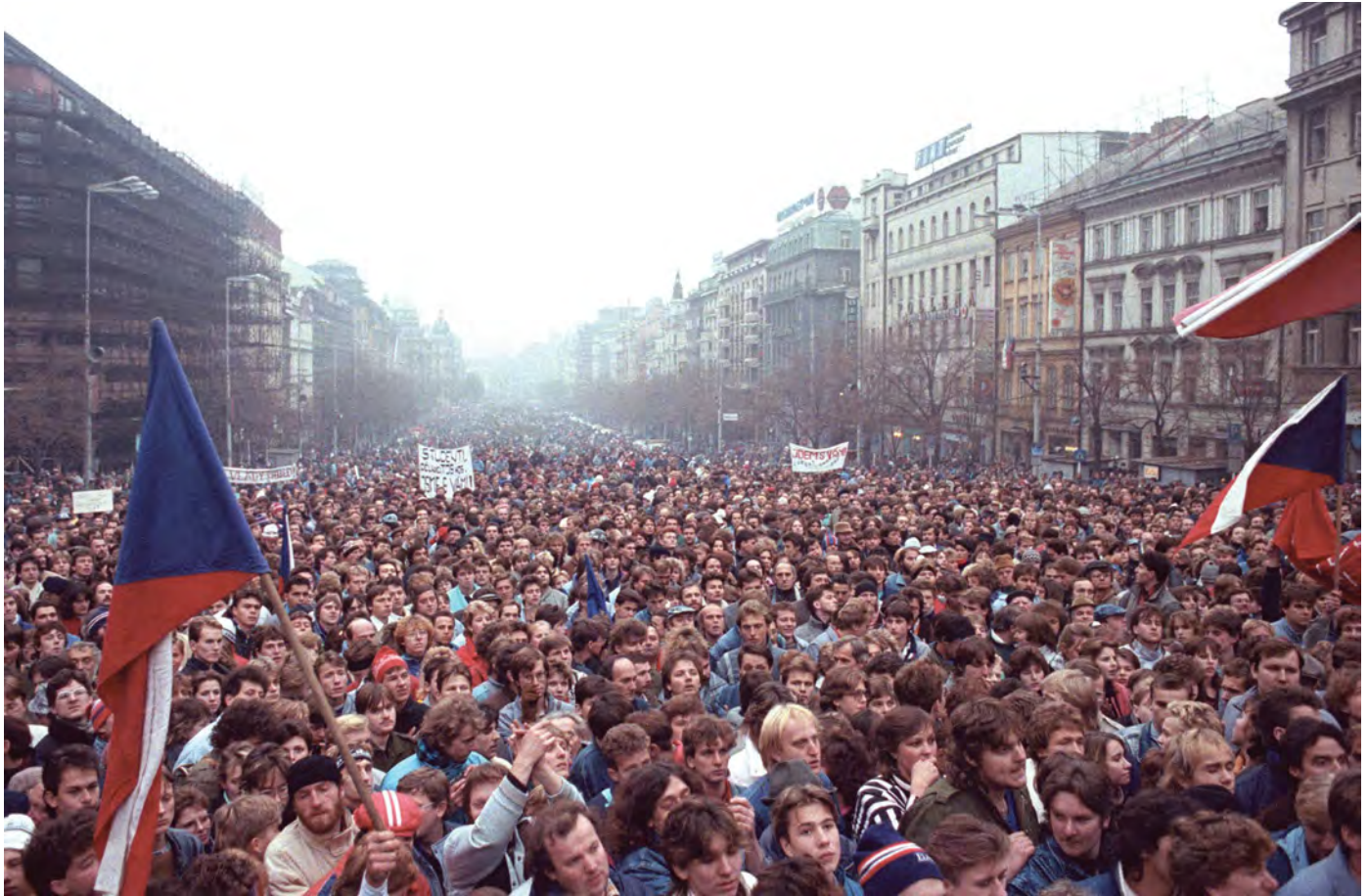
Over two hundred thousand demonstrators took to the streets on the fifth day of protests on November 21, 1989 in Prague. The demonstrators were demanding reforms and the resignation of the government.

what “neutralization” —meaning ceding hegemony to Moscow— would mean when interpreted by Stalin.