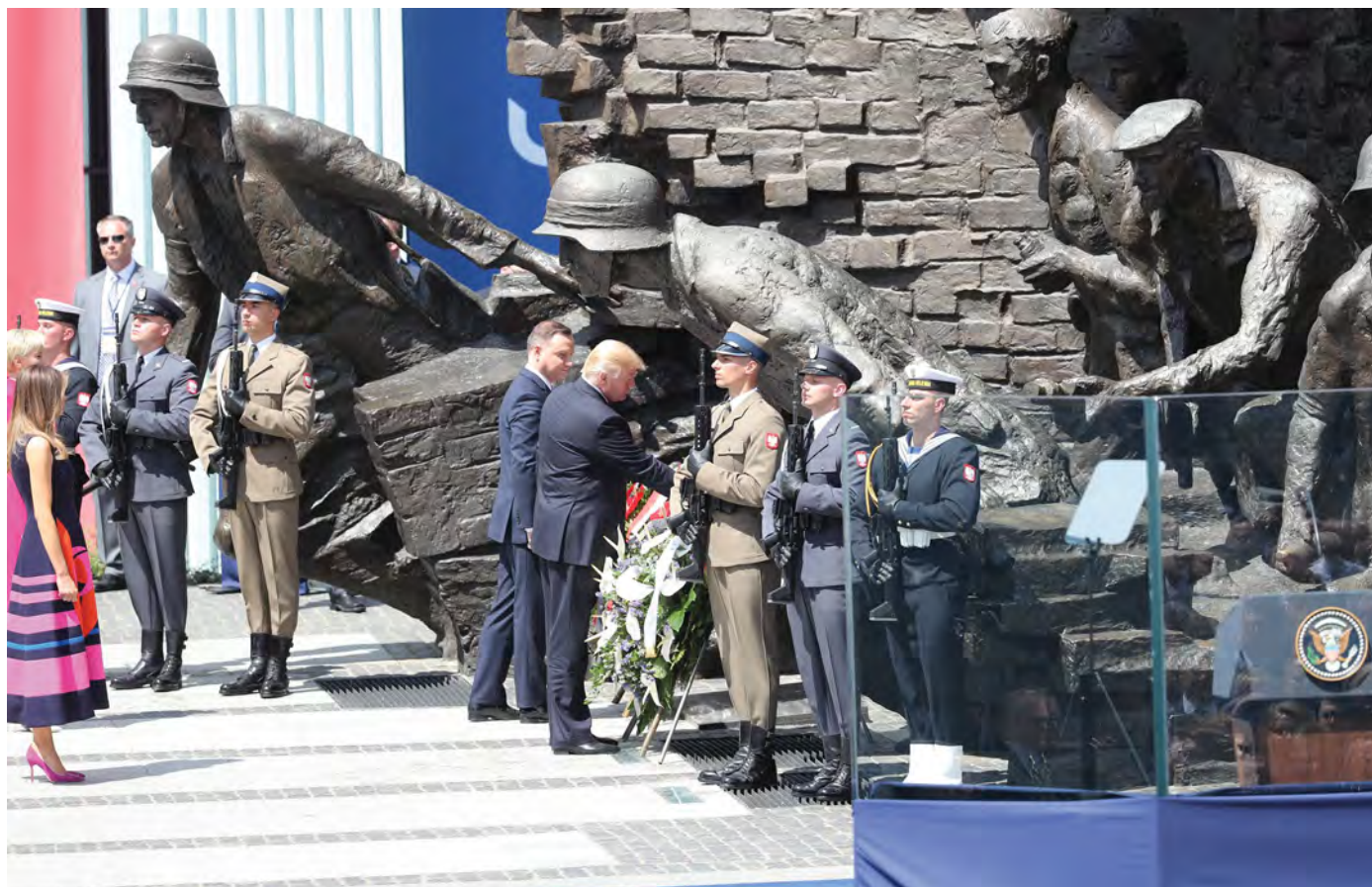
US President Trump stands alongside Polish President Andrzej Duda at the Warsaw Uprising Monument in Warsaw, Poland on July 6, 2017.

The United States should raise its public profile on security in Central Europe. Without increased US presence, through high-level visits (executive and Congress) and through think tanks and other nongovernmental organizations, Russia can continue to exploit the information space in Central Europe. Furthermore, if negative perceptions of the United States in the region remain unchallenged, such trends may continue to rise and, in the short term, undermine NATO's principle of collective defense, while causing greater harm in the long term.