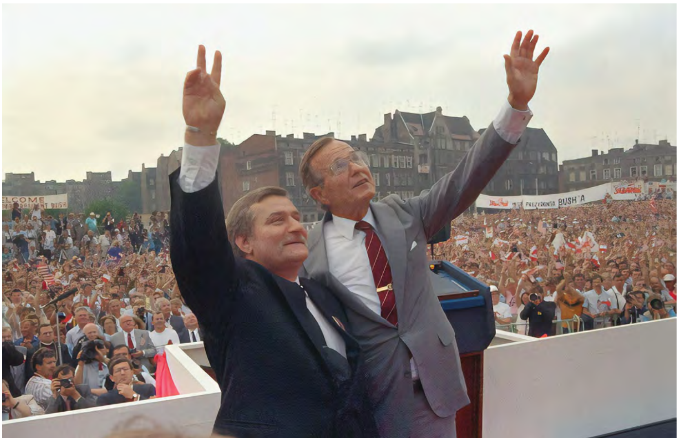
President George Bush (r) and Solidarity leader Lech Wałęsa (L) stand before a crowd of thousands of people today in front of the monument dedicated to the workers who died in 1970 strikes in the Lenin Shipyard next to the monument.

Another topic could include business dialogues addressing cutting-edge opportunities (such as cyber) and the challenge of how to maintain an entrepreneurial edge given the power of state-owned large enterprises. The explosive growth of small and medium enterprises in the initial period of post-1989 reforms saved many Central European economies and propelled