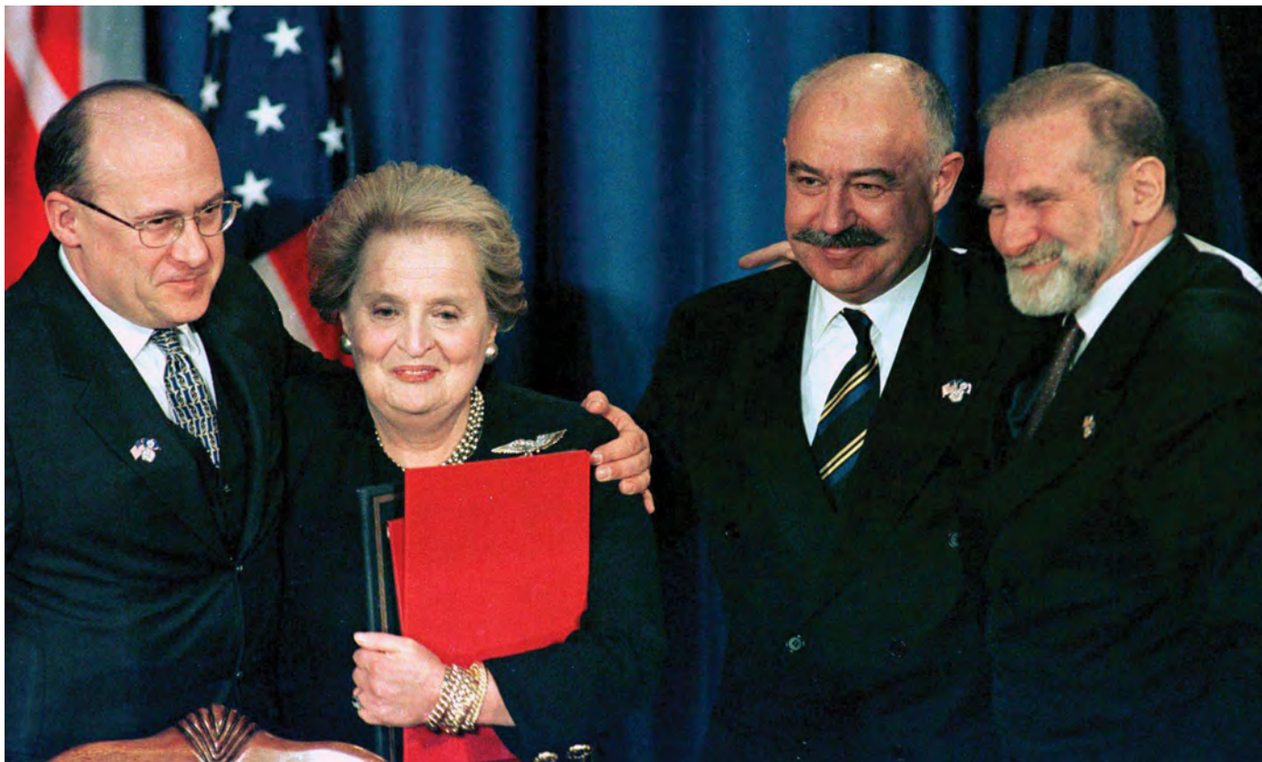
US Secretary of State Madeleine Albright stands with the foreign ministers from Czechoslovakia, Jan Kavan (L), Hungary's Janos Martonyi and Poland's Bronislaw Geremek (R) following the three countries' accession into the NATO alliance at the Truman Library in Independence, Mo., March 12.

likely to keep the region in the Western community, there will inevitably be some variance among countries in terms of how actively they are involved in various institutions. Even so, it should be the United States' goal to keep Central Europe firmly integrated in the Western democratic order.