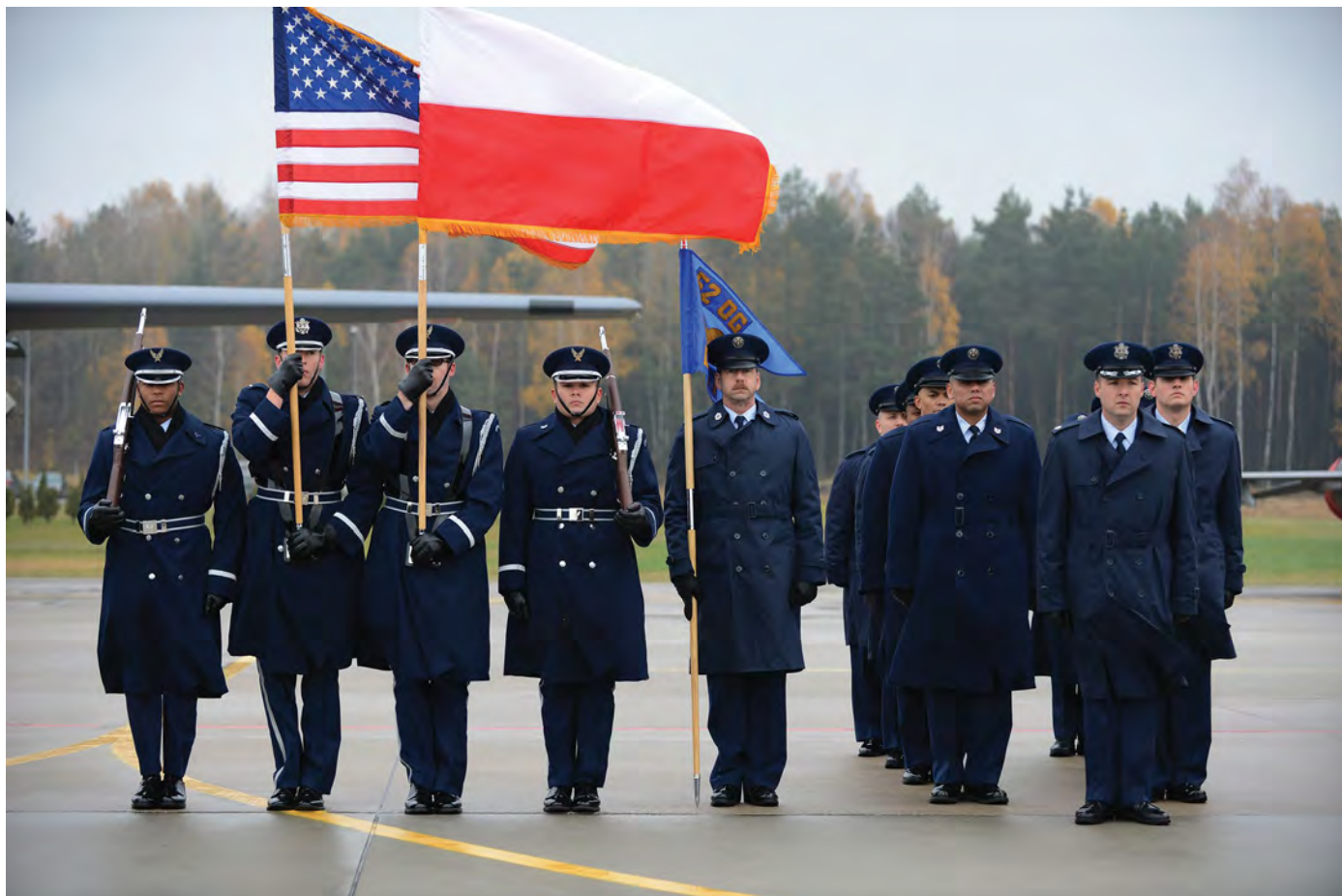
Members of the 52nd Operations Group and Spangdahlem Air Base Honor Guard stand in formation during an Aviation Detachment activation ceremony on the flightline at Lask Air Base, Poland, Nov. 9, 2012.