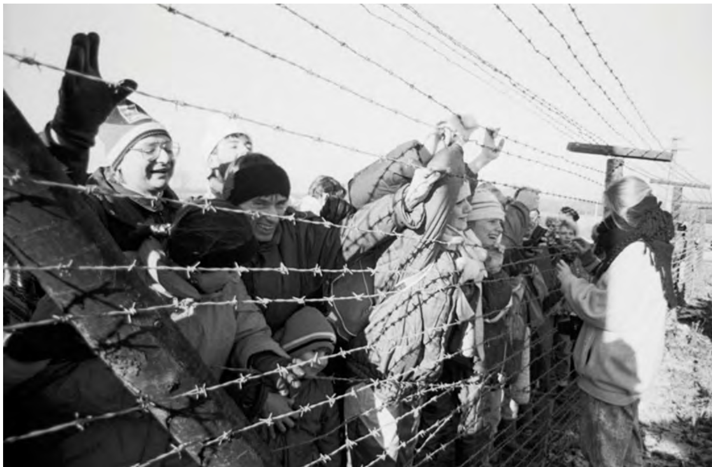
During the Velvet Revolution in Slovakia, the Public Against Violence movement organized a symbolical step toward Europe on December 10, 1989, when about 100,000 Slovaks marched from Bratislava across the border to Hainburg, Austria. Border guards could not stop the peaceful protestors from cutting the barbed wire into pieces and crossing the border.

history, values, and the struggle against communism. The Western tradition—including the Enlightenment and older Christian traditions—qualifies sovereignty by positing that even a king is answerable to higher standards. The US public narrative could also emphasize that a strong, modern state has strong, independent institutions; a politicized state that allows for “telephone justice” is, in fact, a weak state.