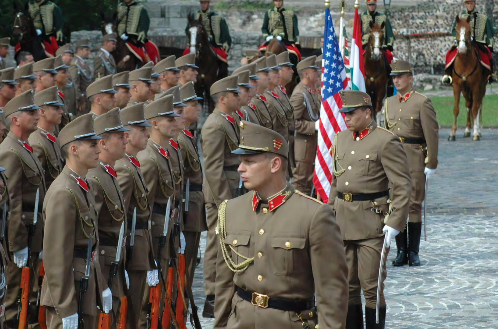
Military of Hungary welcomes President George W. Bush to commemorate the 50th anniversary of the Hungarian Uprising (June 2006).