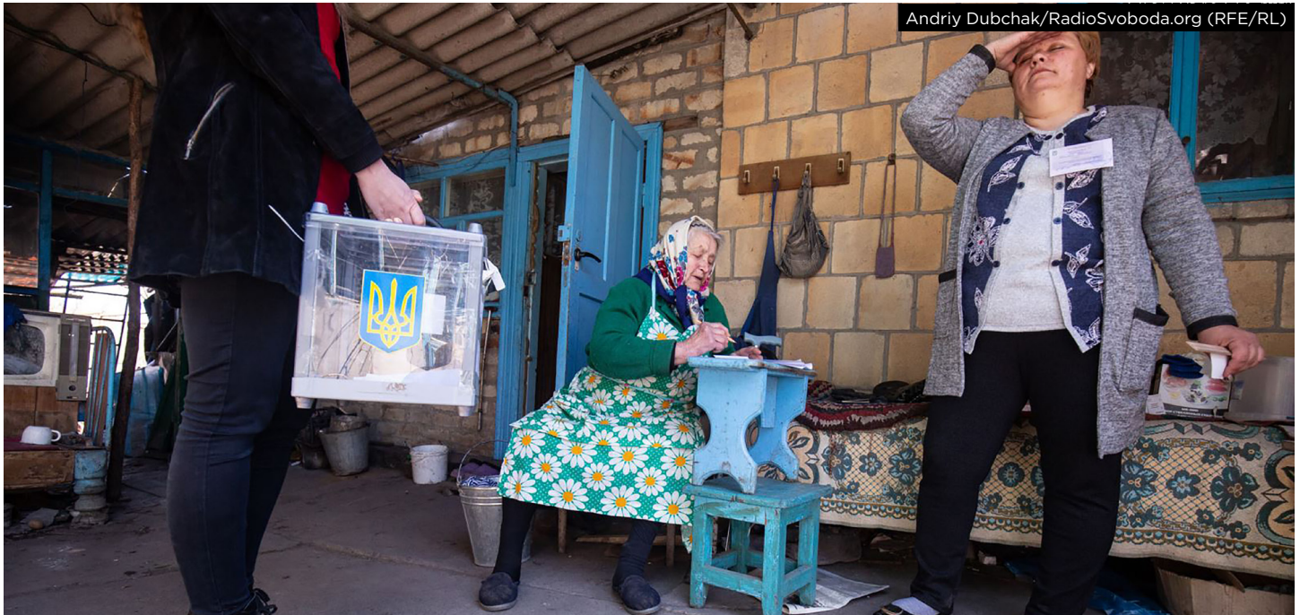
Andriy Dubchak/RadioSvoboda.org (RFE/RL)

Ukraine’s success in becoming a prosperous, functional, and liberal democracy and European country is an existential threat to the current Russian autocracy. Photo credit: Andriy Dubchak/RadioSvoboda.org (RFE/RL).