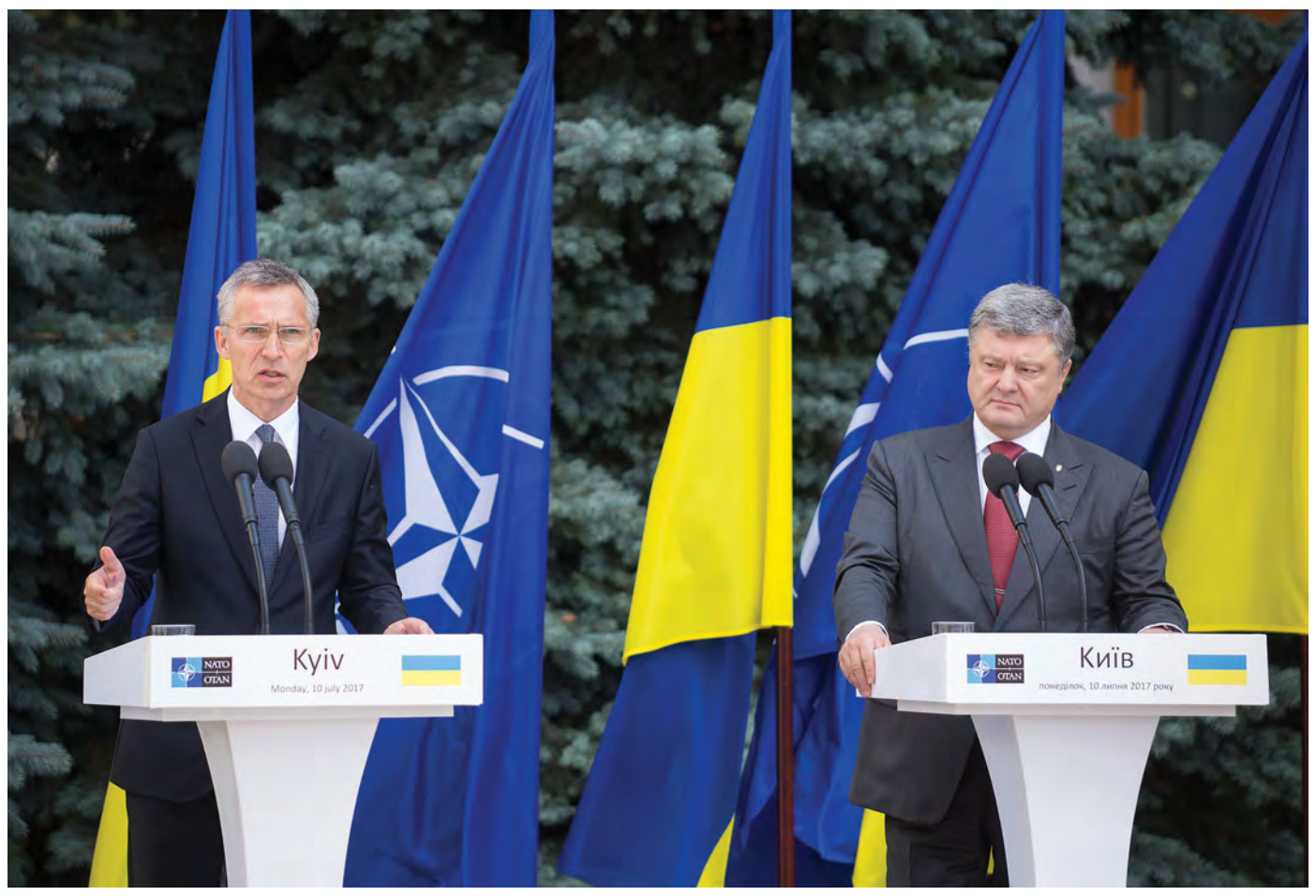
President Petro Poroshenko and NATO Secretary General Jens Stoltenberg at a meeting of the NATO-Ukraine Commission, 10th July, 2017.

In the 1990s, the EU, NATO, and the United States embraced these principles and built their policies around them. They offered assistance to all the countries that emerged from Soviet ruins and were aiming to transition to an open society, including Russia. They boldly proclaimed their vision of an undivided Europe, whole and free. And, while not missionizing, they considered the sovereign choices of those nations from the post-Soviet world that sought admission to NATO and the EU. As those applicant nations met the standards set, they became members.