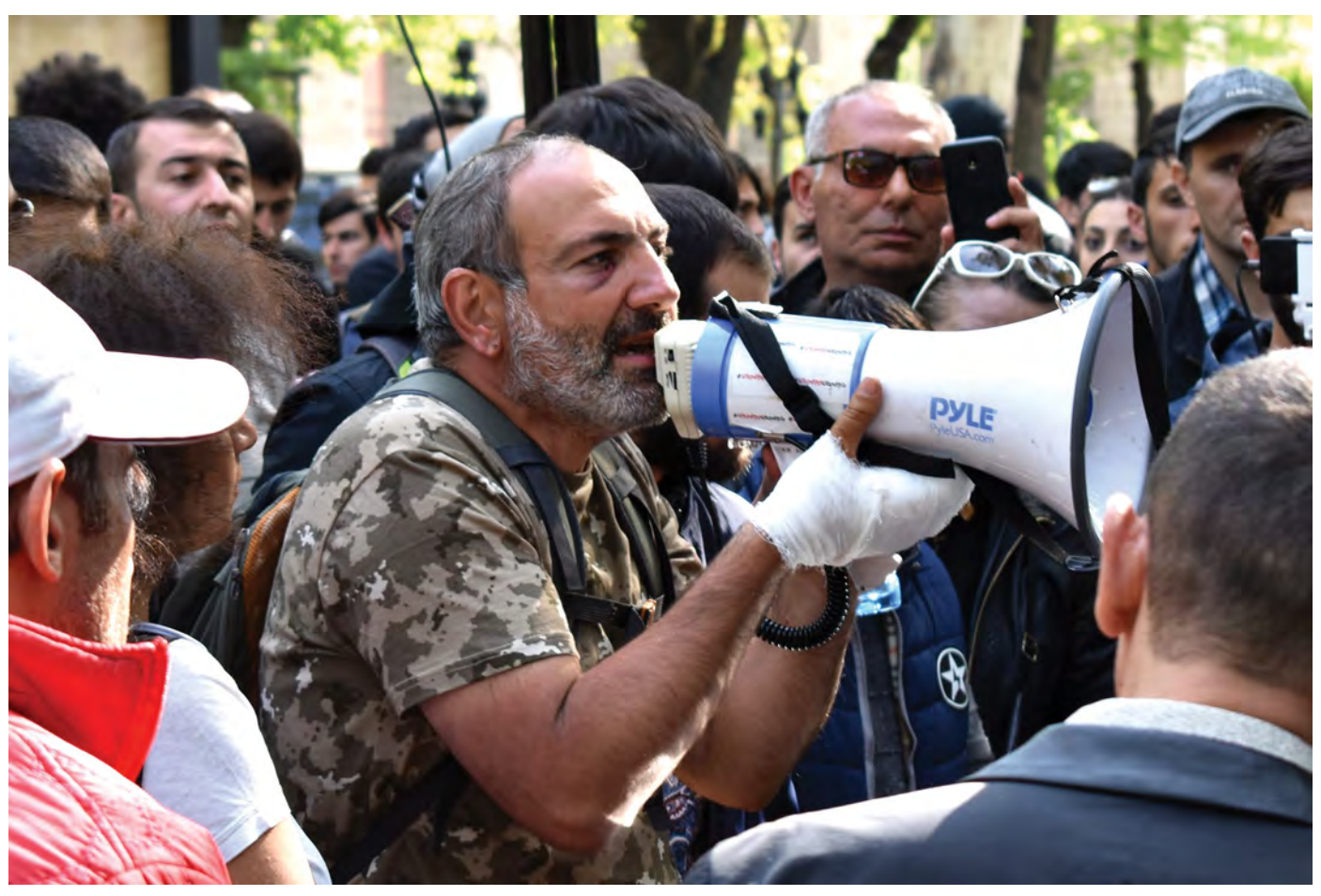
Armenia, Azerbaijan, and Belarus are also part of the grey zone. They receive less attention because they have not pursued closer relations with the EU (or NATO) as energetically as Georgia and Ukraine, and, therefore, have received less pressure from the Kremlin.

corruption, much more needs to be done in Ukraine and Moldova. The West's support reforms through the use of conditional aid is an essential tool.