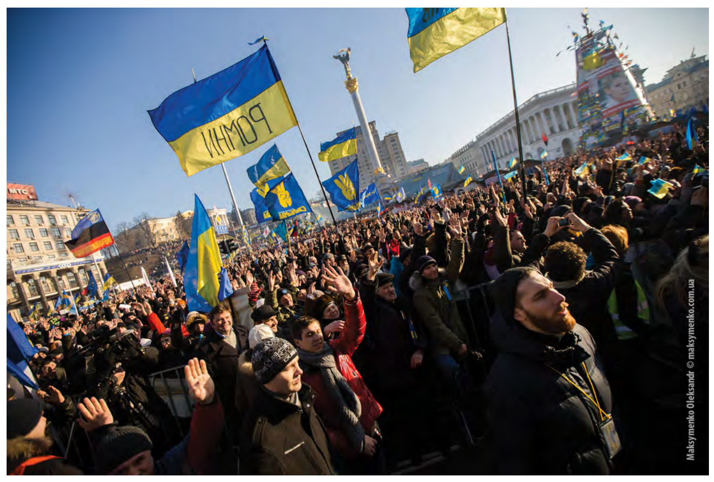
Protesters on the Maidan, embracing the vision set out by West.

These developments were also consistent with the vision of Western statesmen to integrate the nations that came out of the Soviet Empire, including Russia, into the liberal institutions created in the years after World War II—the UN, the IMF, the World Bank and the World Trade Organization. That vision also included creating a Europe whole and free.