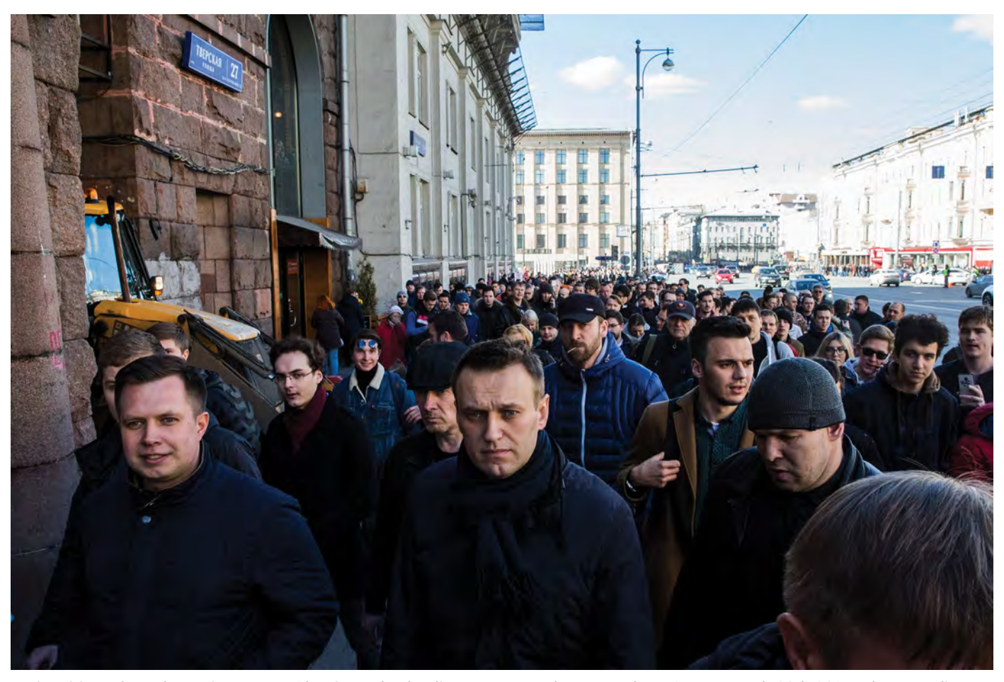
Putin critic and regular regime target Alexei Navalny leading protesters down Tverskaya Street, March 26th 2017.

To the Kremlin, the upheavals in Serbia, Georgia, and Ukraine were not domestically driven, but the creation of the West—especially the United States. By the February 2007 Munich Security Conference—after six strong years of economic growth, two rounds of NATO enlargement, and the Orange Revolution in Ukraine—Putin delivered a speech laying out the anti-Western animus of his policy, and his frankly revisionist aims.<sup>16</sup> Those aims included