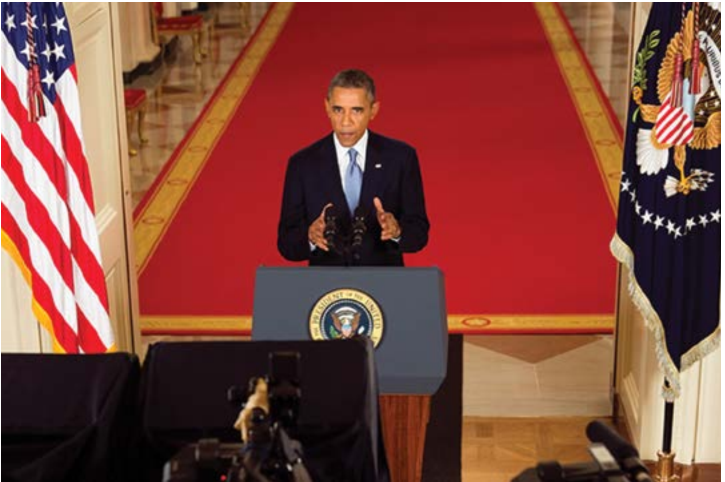
President Barack Obama delivers an address to the nation regarding Syria, in the East Room of the White House, Sept. 10, 2013.

in ways that complicate but do not prevent the useful projection of US power. Syria's failed revolution could encourage introspection and a revitalization of the US role in the Middle East in pursuit of US values and interests. Alternatively, Syria could be a precursor to recurrent conflicts in a post-Pax Americana Middle East that will inhibit regional development and threaten global security.