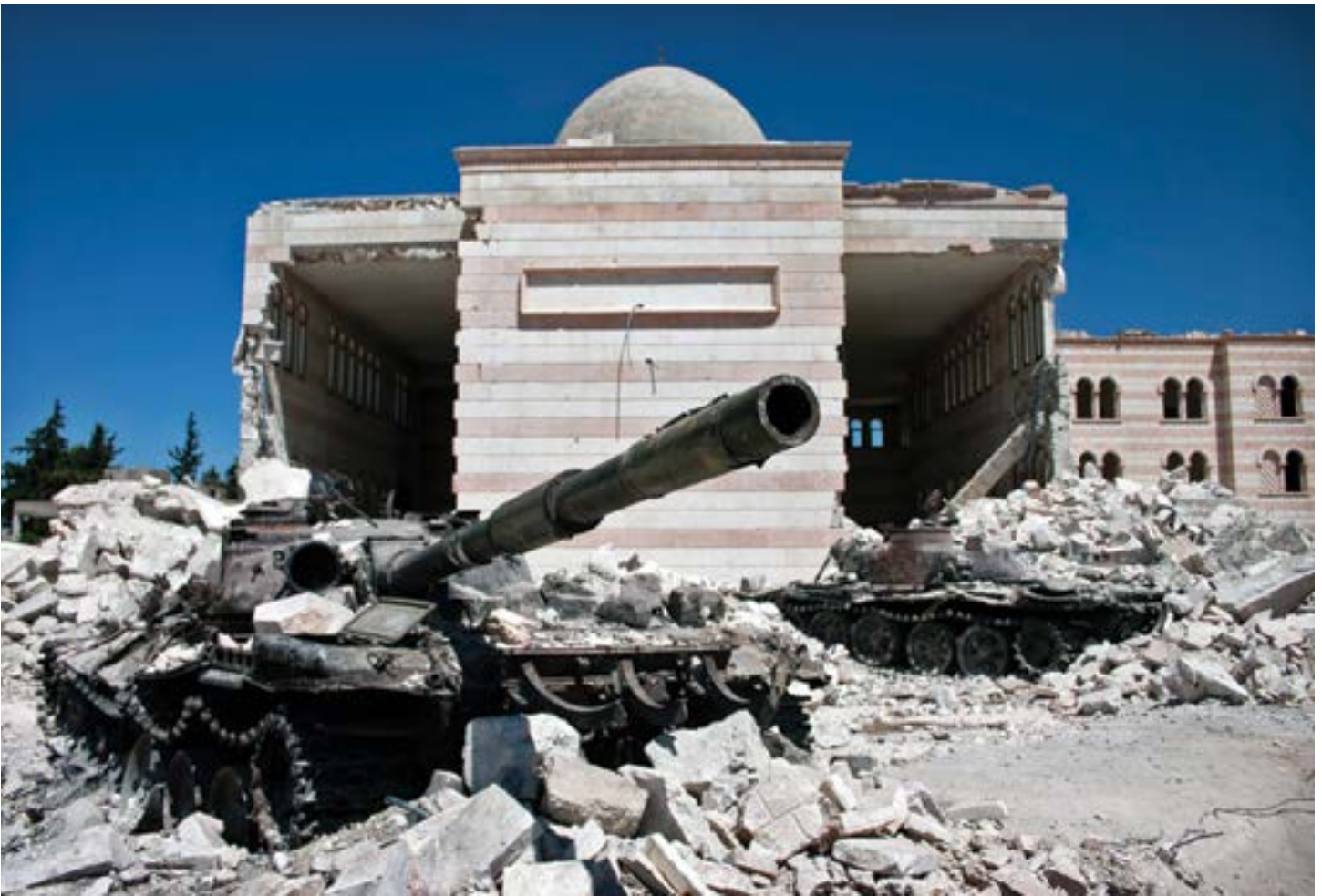
Two destroyed tanks in front of a mosque in the city of Azaz, north of Aleppo, during the Syrian civil war.

peaceful protest movement—no moral universe would assert itself there. The United States might have paid lip service to supporting Syrians, but did not commit to supporting the revolution's outcome, much less to forcibly removing Assad and assuming responsibility for what followed.