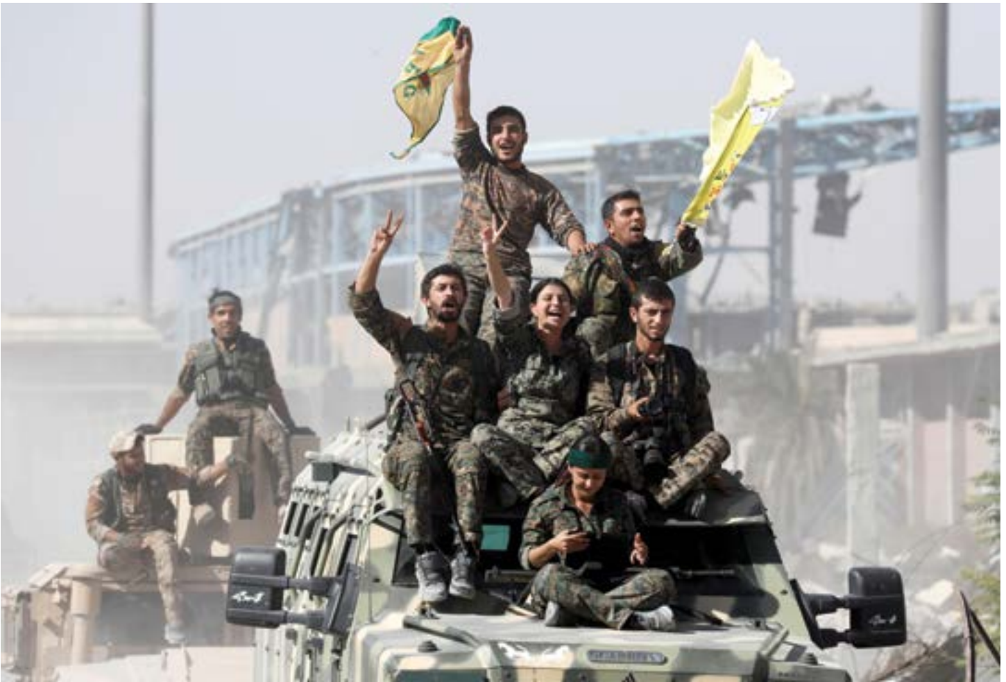
Syrian Democratic Forces (SDF) fighters ride atop military vehicles as they celebrate victory in Raqqa, Syria, October 17, 2017.

beneficial to project power to protect allies and reduce the gains of historic rivals such as Iran and Russia.