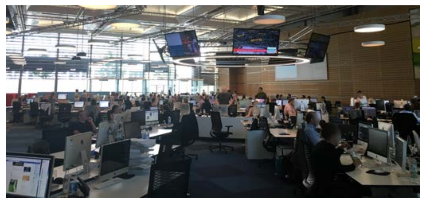
WELT Newsroom at the Axel Springer house in Berlin, 2016

right to their opinion. But if they desire a better quality of politics and society, then they need to have an awareness of the information bubble in which they live. They must also seek to balance their perspective by exposing themselves to views that they may not fully understand or agree with. Improved education in schools and colleges will help in the long-run—and again there are already experiments underway in this field-but an immediate response is for individual citizens to collectively demand more from the content generators and broadcast platforms and to work toward building a society resilient to disinformation through increased education. Individuals also need to understand that they are now their own media entity: what stories and information they project over social media, either from personal experience or sharing news they have read, have a tangible impact that contributes to the broader information environment. It is a responsibility all need to understand and embrace. If this can lead to the reestablishment of some degree of shared facts, then serious policy debate can resume, and trust will slowly be rebuilt.