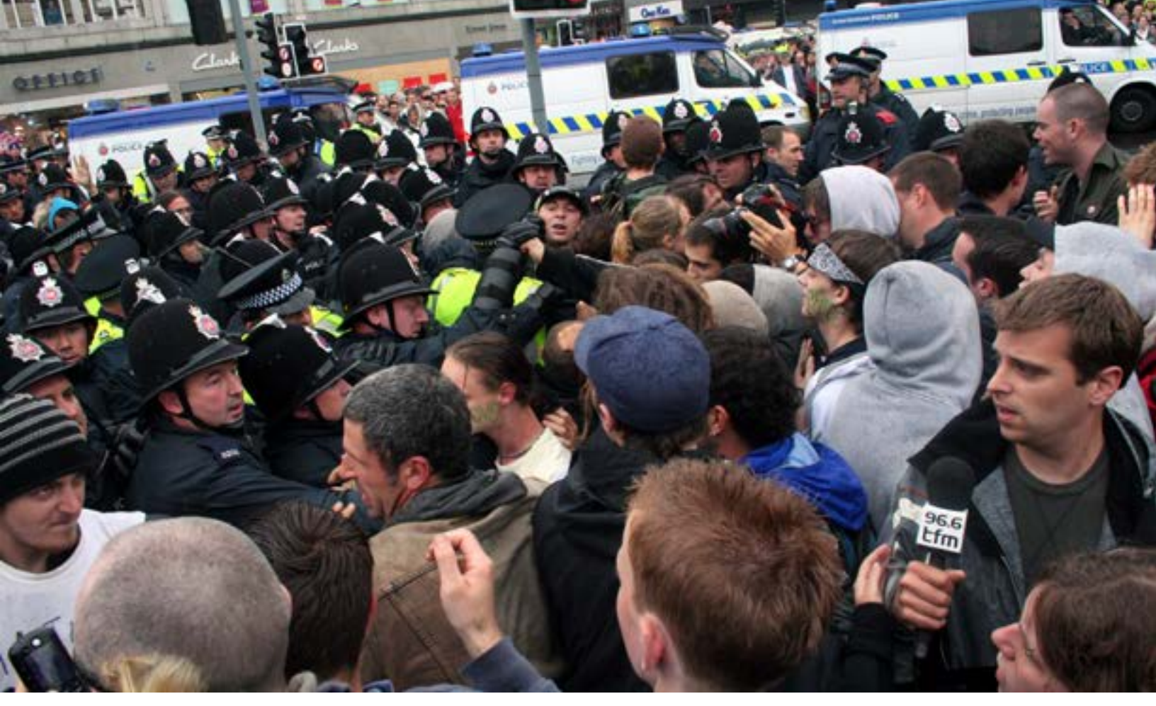
Police and protesters clash in Edinburgh ahead of the G8 protests, 2005

truth. A discussion of what constitutes truth can quickly become deeply philosophical, abstract, and challenging. It echoes the writings of some of the world's greatest thinkers, from Plato to Descartes. These discussions arose during the Sovereign Challenge conference, and they illustrated how difficult it can be to agree on the definition of even the most foundational elements of the discussion. A thorough examination of these terms, their definitions, and the logic that underpins them belong in a longer and more academic piece. But for the purposes of this discussion, it is necessary to establish some simple working definitions. While "fact" and "truth" are often considered synonymous, they actually have very different meanings in this discussion. The commonly held definition of "facts" are that they objectively exist in reality, regardless of belief, culture, or other consideration. They cannot be logically disputed. "Truth" on the other hand is made up of facts, but can be tempered by beliefs and interpretation. As such, two people can draw two different "truths" from the same set of facts.