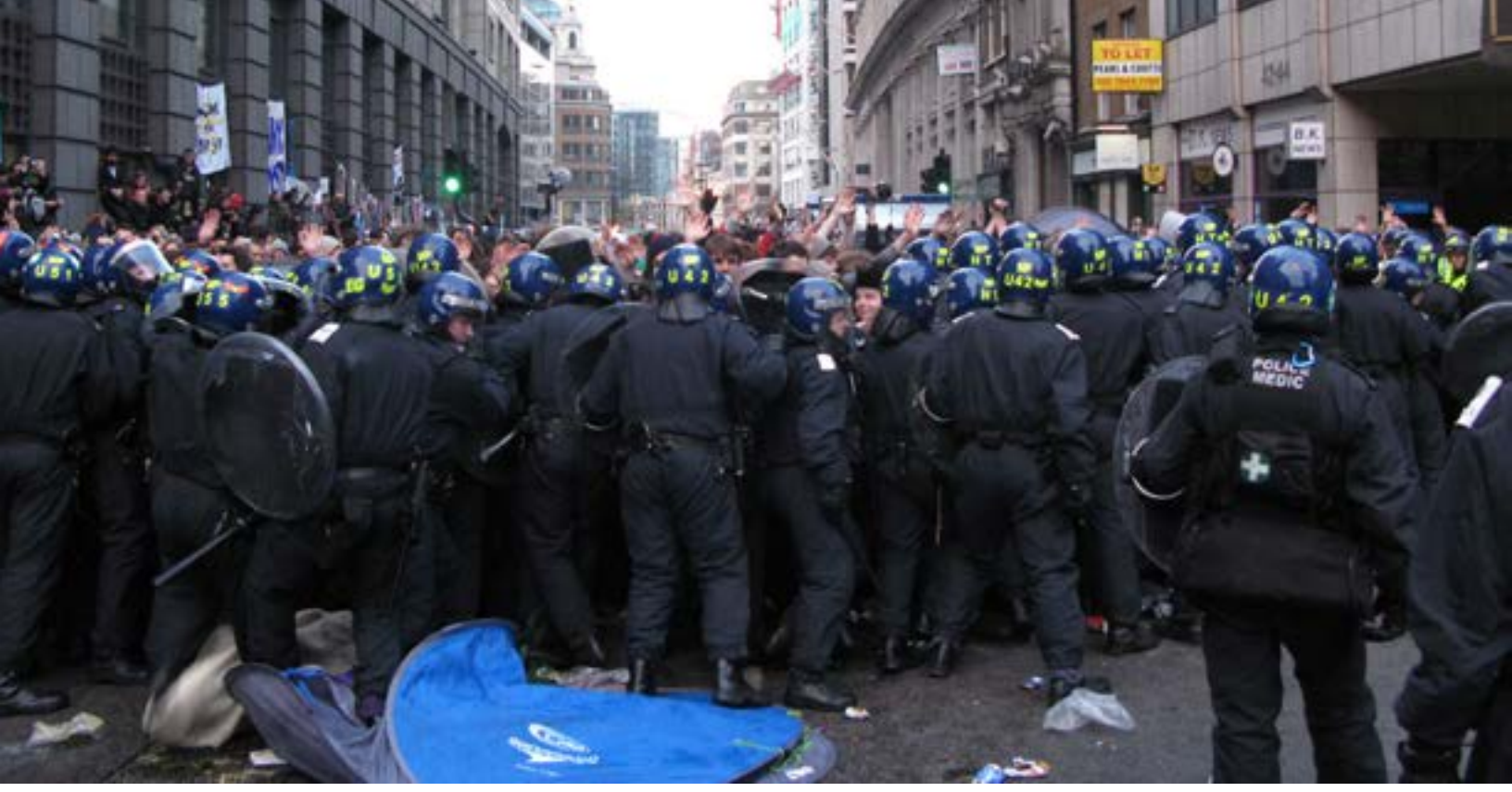
Riot police officers "kettle" protesters at the Bishopsgate Climate Camp, London, 2009

worry about fake news, and believe that fabricated news causes confusion, particularly about basic facts.<sup>9</sup> This loss of truth and trust is neatly demonstrated by the Edelman Trust Barometer, In which 59 percent of respondents to the survey stated they are no longer sure what is true and what is not with 56 percent not sure which politicians to trust and 42 percent not sure which businesses.<sup>10</sup> A central challenge in the modern media environment is the explosion in potential sources of information or "content" with limited accountability resulting in a dilution of the quality. Importantly, the Edelman survey defined media as not only journalists and traditional publishers, but also "influencers," "brands," and broadly defined "content producers."