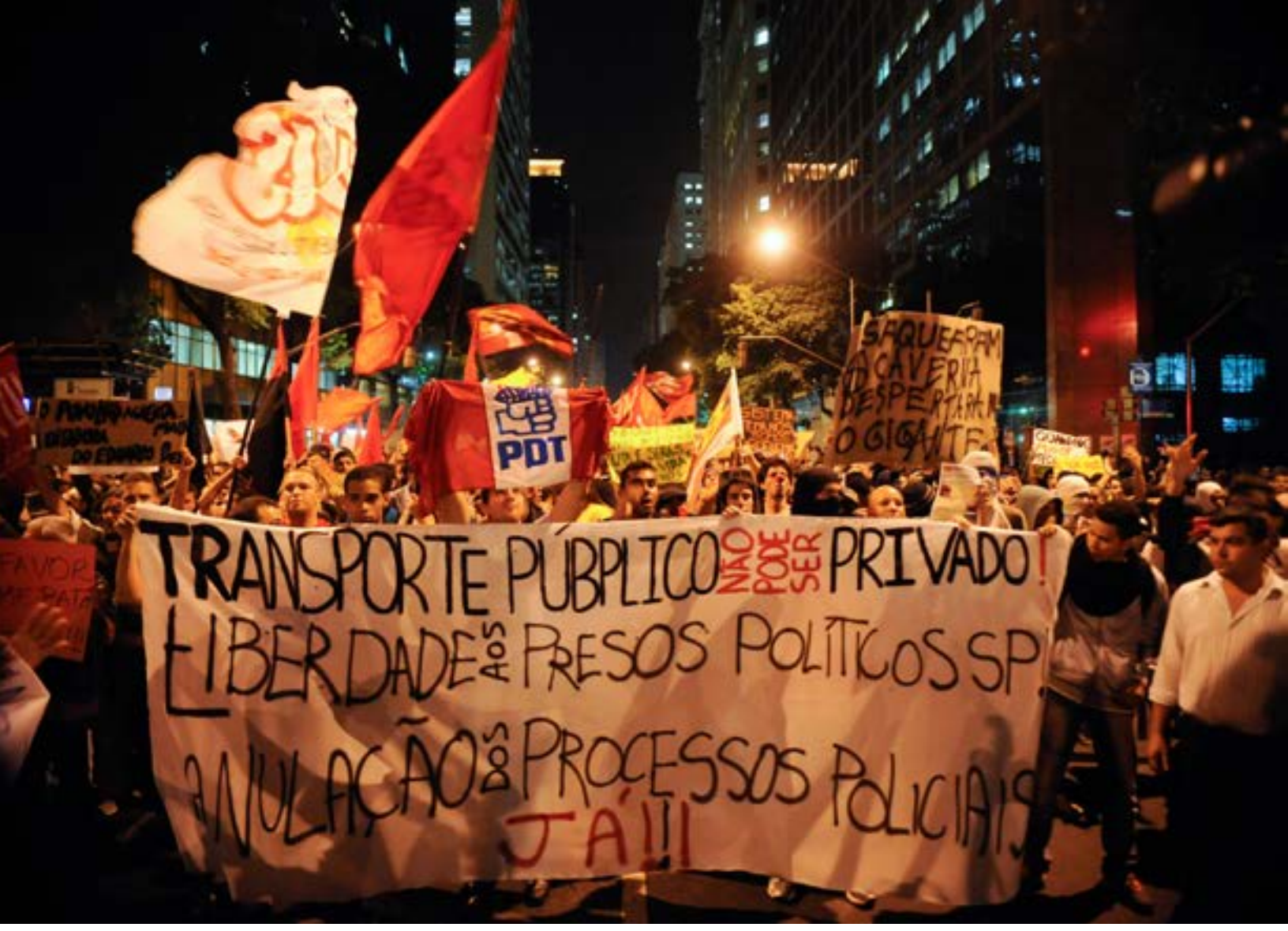
Brazilian Protestors, 2013

of government that give sovereignty its legitimacy and power. It is also, therefore, a critical vulnerability that is underpinned by the information upon which people build their perceptions and beliefs. All societies rely on trust to function, but it is particularly critical in democracies. Disinformation erodes trust by shifting societies' perceptions and beliefs about government and its institutions. This can result from actions by external threats, but also occurs organically when disinformation about basic facts, scientific methods, and conspiracies are spread to sow confusion and advance specific agendas. When disinformation creates false perceptions and undermines beliefs, societal trust is eroded and thereby a nation's sovereignty threatened.