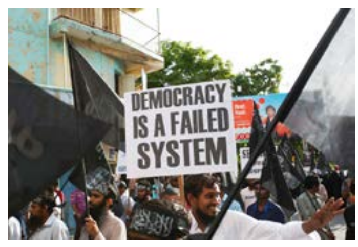
Street Protests in Maldives, 2014

Disinformation has also become a common political tool in many countries, with extremists in particular harnessing the medium to influence political views. In Indonesia,<sup>13</sup> India,<sup>14</sup> and many other developing countries, teams work full time to track narratives, smear opponents, and spread disinformation as part of normal political campaign activity. In doing so, they stoke sectarian and religious tensions and increase political polarization. In Kenya during the 2017 election, Islamist extremists and agitators of tribal divisions used similar techniques to actively engage anyone who may be sympathetic to their views. Digital penetration in Kenya is one of the highest in Sub-Saharan Africa at almost 90 percent, with around 72 percent of those users active on Facebook. Over twenty extremist groups took advantage of this platform to communicate with their