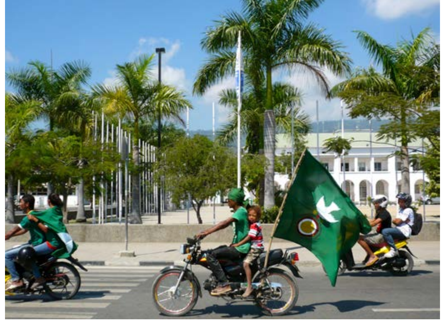
Supporters of KHUNTO Party campaigning on motorcycles during the 2012 parliamentary elections in Dili, Timor Leste, 2012

rule of law and effectiveness of governance that underpin national sovereignty as much as any other societal actor. In a less abstract and directly relevant way, ethical business is a best practice that is important to modern consumers. Just as "sustainable," "eco-friendly," "ethically sourced," or "American made" are key marketing messages, "fact-based" content generation and broadcast should be a central business practice. Several large tech companies are already moving to align with these principles and experimenting with ways to highlight the source of information. A useful first step is to affix information to online content about who owns or funds the creator of that information, in a similar way that food products carry nutritional information. Additional nutritional information on food items does not prevent someone buying an unhealthy food option, but they can at least understand what it is they are purchasing. In the same way, people would be free to read any content they like, but would have a better understanding of its inherent bias and overall reliability.