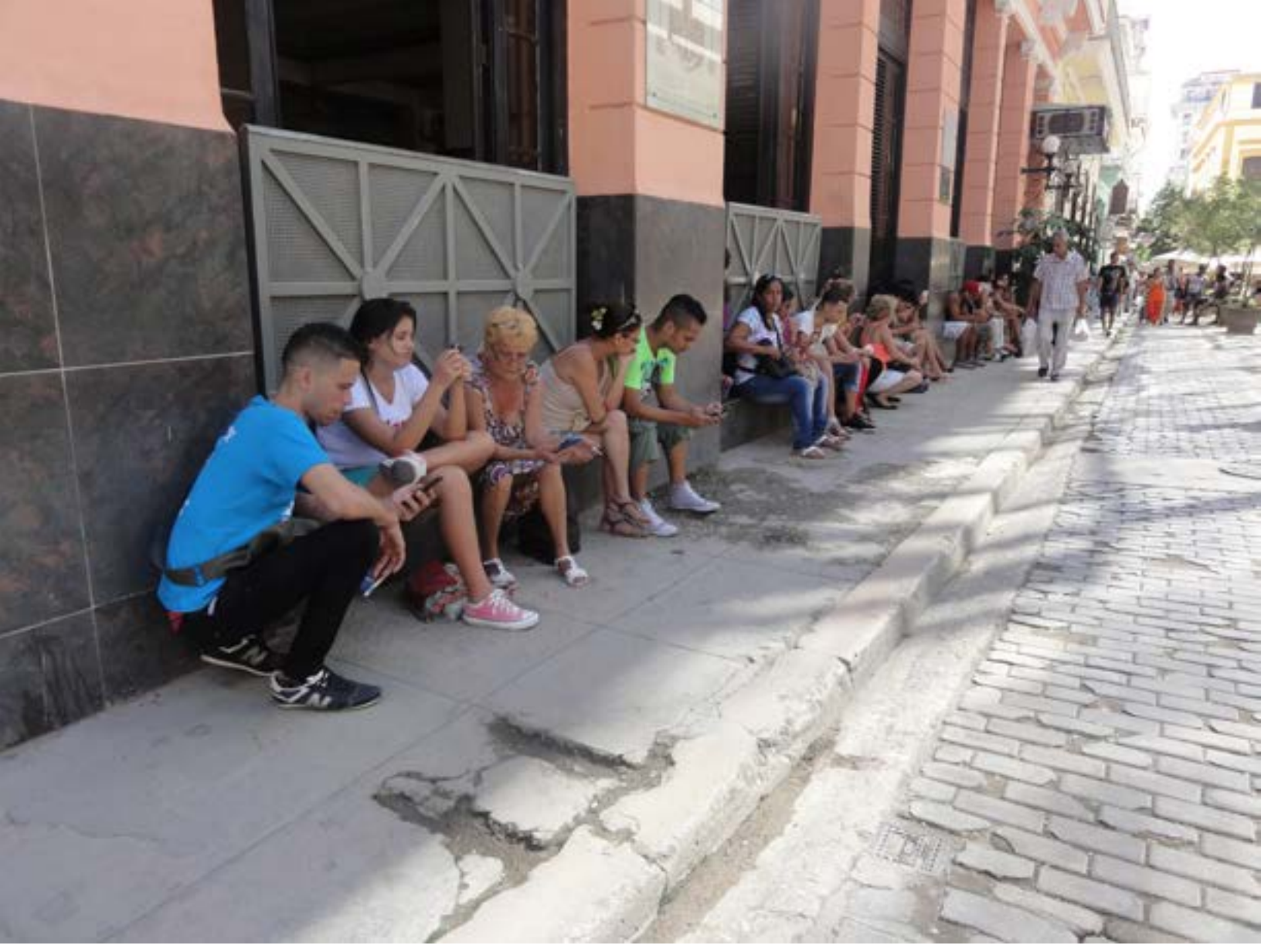
Cubans use a WiFi Internet HotSpot in Havana, 2015

more compelling ways. It creates a narrative that ties together meaning and identity and that communicates a larger message to the reader than the story itself, building on preconceived beliefs and assumptions while reinforcing bias. Familiarity is a key tool of an effective disinformation campaign, as people infer or assume messages that do not need to be explicitly stated. This can be communicated through apparently innocuous terms or imagery and is sometimes referred to as a "dog whistle"—a message that only select segments of a population understand or perceive. Once disinformation and the narratives it supports become truly embedded in a community's culture and gives meaning to people, it becomes mythologized and impervious to facts. Therefore, it cannot be easily resolved. The active