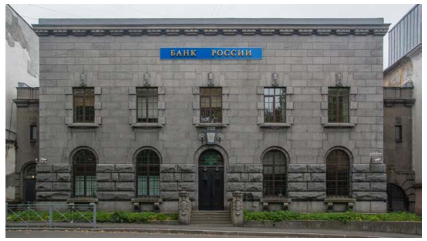
Putins's cronies are shareholders in Bank Rossiya, which they use to manipulate and profit from state entities.

Russia's kleptocracy did not arise by chance. Putin and his associates have intentionally built this system, which makes them immensely wealthy and endows them with extraordinary political power. The system provides economic stability, though minimal economic growth. But the Kremlin is clearly satisfied with the regime and shows no signs of aspiring to any reforms, and it seems pointless to expect any major changes. Western policy should instead focus on what it can do about the fourth circle, offshore assets.