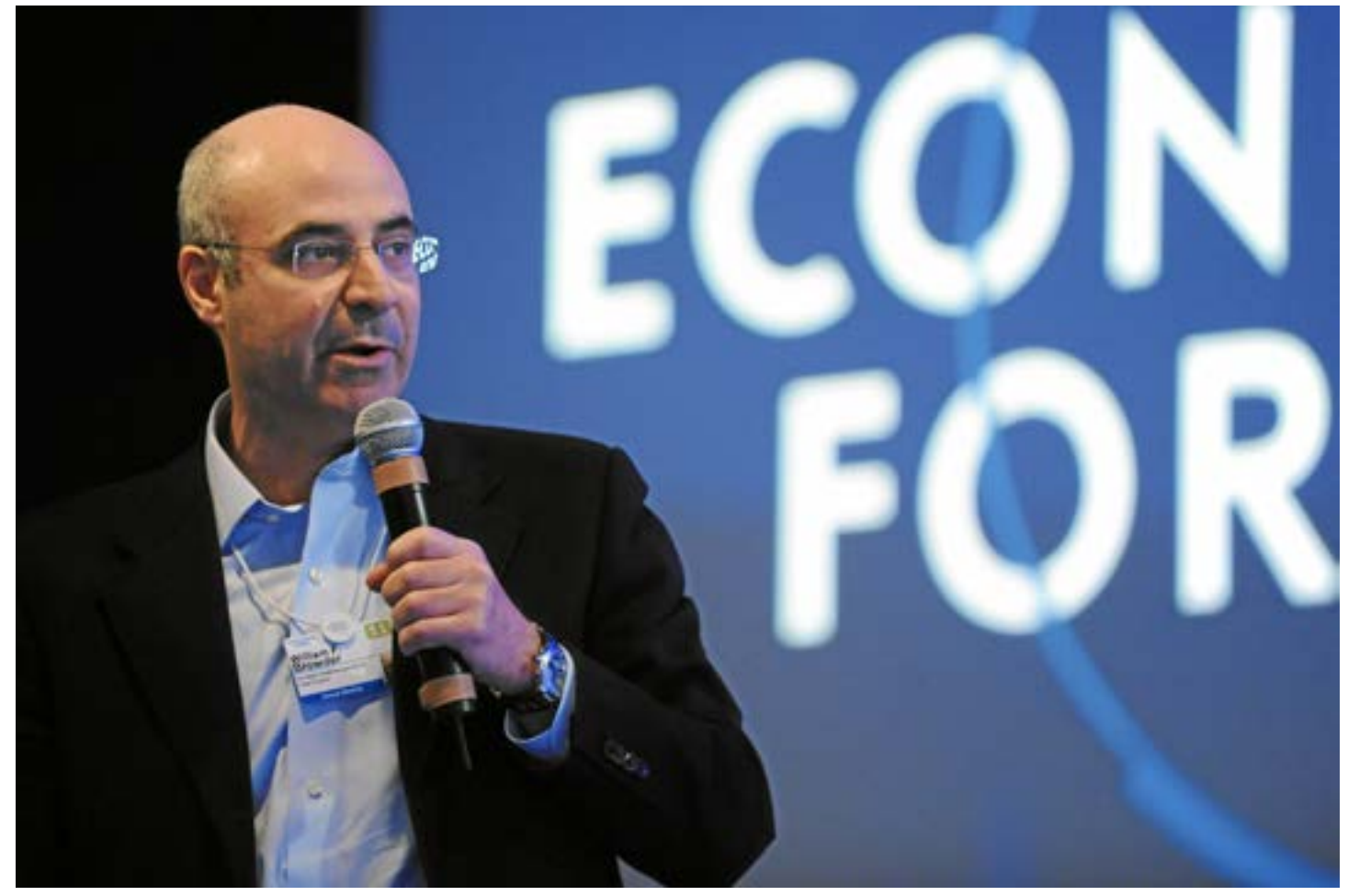
Bill Browder, visionary behind the Sergei Magnitsky Rule of Law Accountability Act, is an outspoken critic of Vladimir Putin.

Caribbean islands but the Cayman Islands, lack financial depth, that is, they do not have sufficiently large financial markets to absorb large assets. After the financial crash in Cyprus in 2013, the International Monetary Fund carried out a forensic study and found that Russian foreign direct investment that stayed in Cyprus itself was only $14 billion.<sup>13</sup> Money just passes through Cyprus and other offshore havens. Only the Cayman Islands has a large banking sector. Therefore, Russian dark money—like most other dark money—is likely to be predominantly in the United States or the UK.