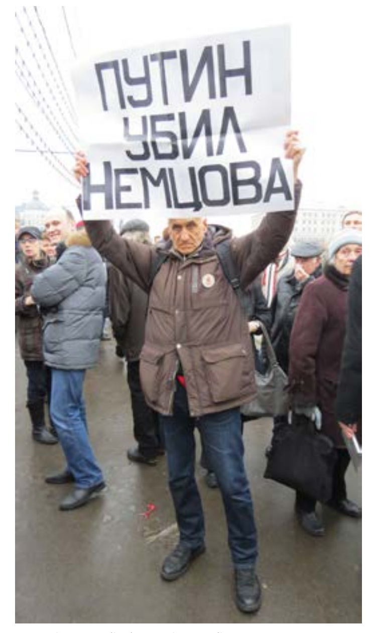
A Russian man displays a sign reading, "PUTIN KILLED NEMTSOV", while standing on the bridge where opposition politician Boris Nemtsov was shot to death at a rally the day after his murder.

Ironically, however, the Kremlin's executive control of the courts has deprived Russia of real property rights. In response, not only ordinary rich Russians but even its rulers need to transfer their assets abroad to keep them safe. They have three requirements for their as-