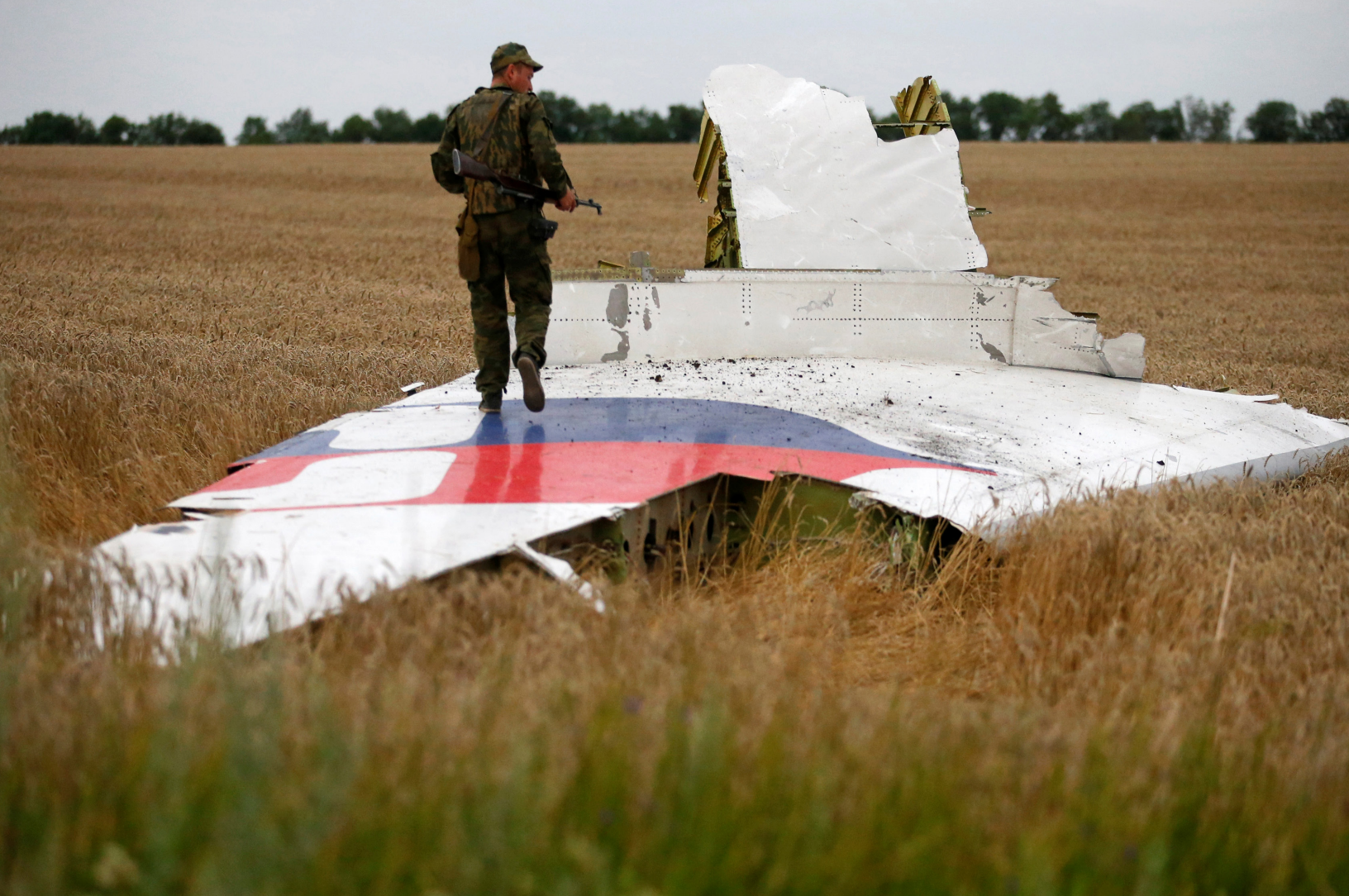
An armed pro-Russian separatist stands on part of the wreckage of the Malaysia Airlines Boeing 777 plane after it crashed in the Donetsk region, July 17, 2014.

Russia is different. In 2013, President Putin said in an interview to RT that, because the network is funded by the government, “it cannot help but reflect the Russian government’s official position on the events in our country and in the rest of the world one way or another.” 62 Even if Putin’s observation does not establish state control, it does, at minimum, make his expectations of the editorial policy very clear.