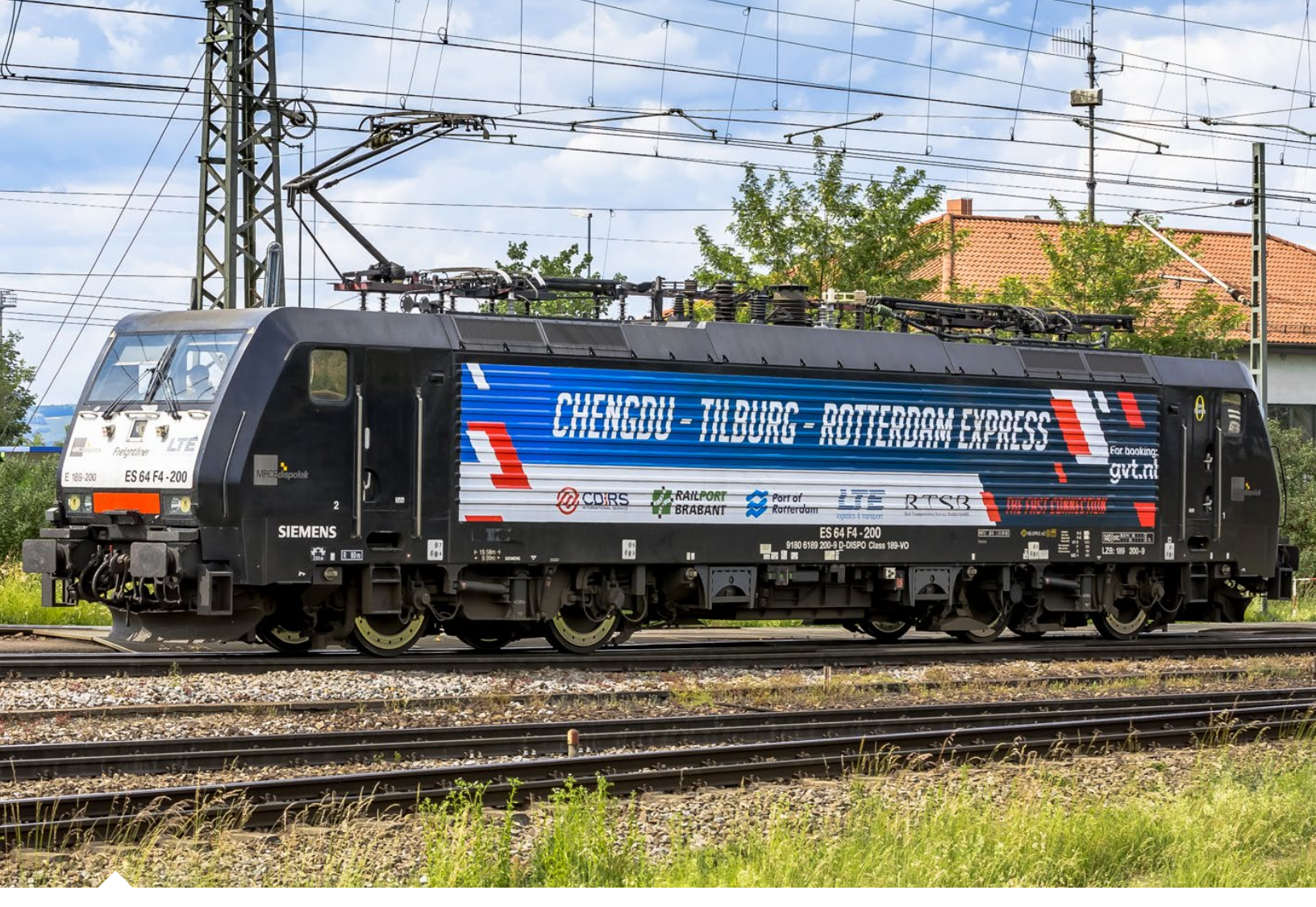
The Chengdu-Tilburg-Rotterdam Express connects China to Western Europe, May 2017.

encouraged cooperation between the EU, European Bank for Reconstruction and Development, European Investment Bank, and other international financial institutions to achieve the aims of BRI, which the EU and European Commission have echoed with the creation of the EU-China Connectivity Platform in January 2016.<sup>7</sup> China also publicly committed to contribute to the EU's Investment Plan for Europe, although no fixed amount of contribution has been set.<sup>8</sup>