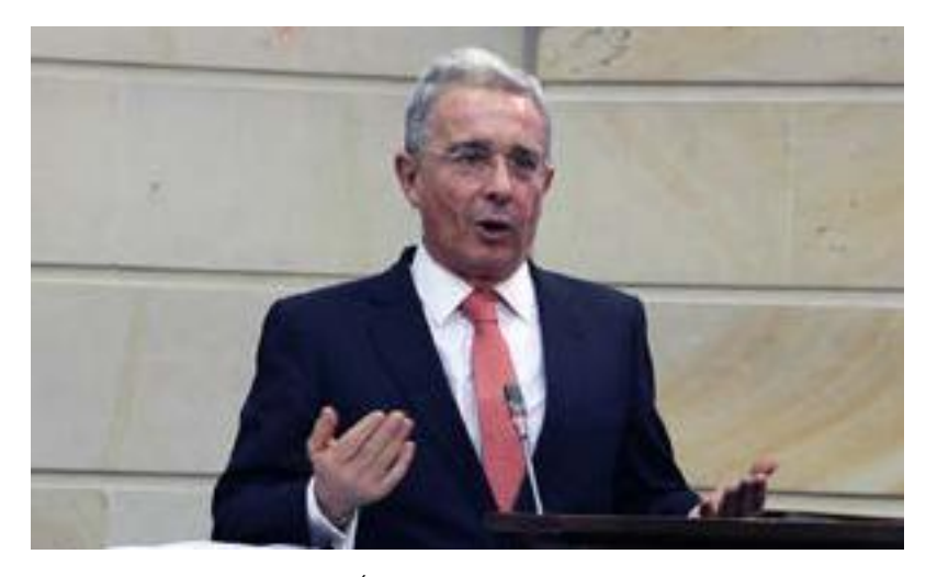
Former Colombian President Álvaro Uribe pushed for a "democratic security" strategy.

For the United States, the benefits of a stronger Colombia have extended beyond stabilizing a hemispheric ally, disarming a hostile guerilla group, and attacking the cocaine trade at its root. Colombia is one of the United States' most consistent and capable hemispheric partners. It collaborates on US diplomatic objectives at the United Nations on issues such as Ukraine, Syria and North Korea, cooperates in the fight against transnational organized crime, provides an expanding market for US products and services, and contributes security expertise to Central America, Afghanistan, several countries in Africa, and the United Nations. Colombia is