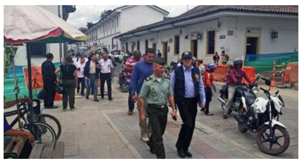
OAS Secretary General Luis Almagro in Colombia in 2015. Peace accord compliance is crucial to regional security.

The US should use diplomatic and programmatic engagement to help enforce peace accord implementation.