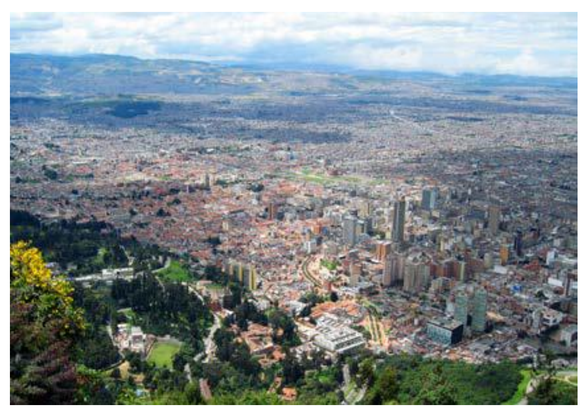
A view of Colombian capital Bogotá. Colombia is one of the United States closest allies.

Our report focuses on how the relationship with Colombia impacts the national security interests of the United States, and how those interests can be advanced most effectively. As such, our report is directed primarily at US policy makers responsible for navigating the transition from Plan Colombia to its successor strategy, Peace Colombia.