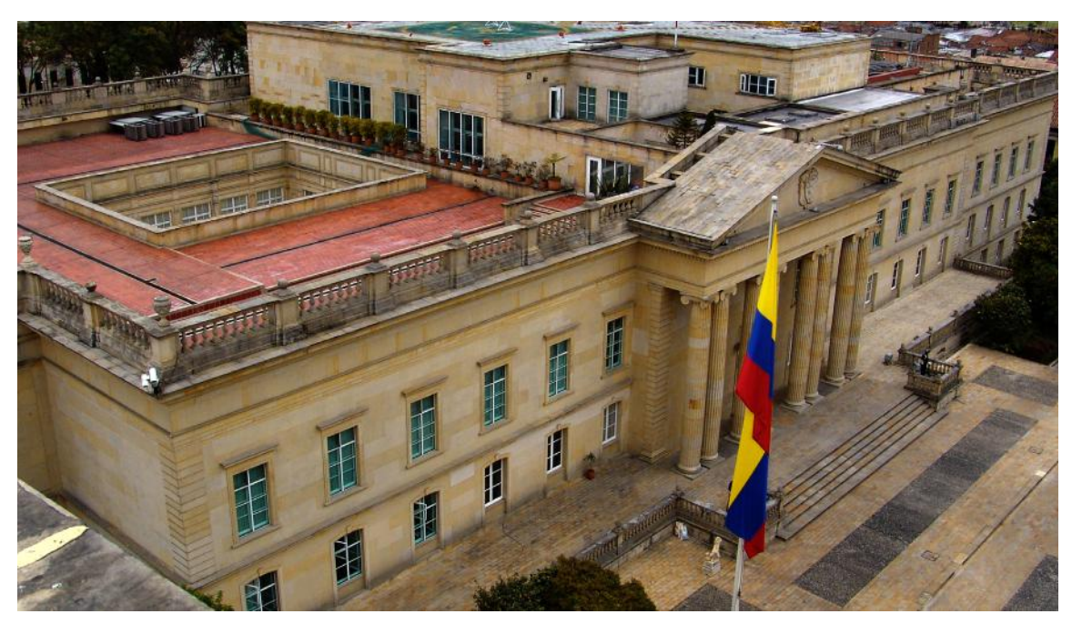
The Colombian government now faces the challenge of implementing a peace agreement with the FARC.

the root causes of the half-a-century conflict, namely the stark economic inequalities, the rural-urban divide, and the historical exclusion of Afro-Colombians, indigenous people, women and poor farmers. The accord includes provisions for full disarmament of the FARC and renunciation of drug trafficking, reparations and land restitution for more than 8 million victims and 7 million internally displaced people (IDPs).