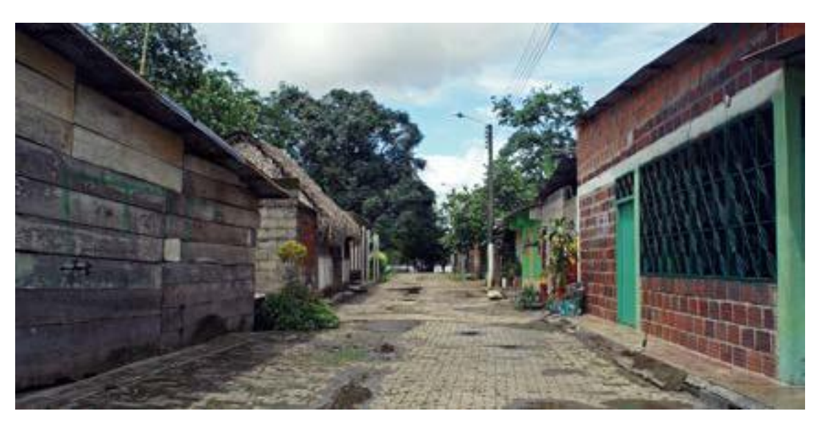
The town of Arauquita, on the border with Venezuela, is increasingly affected by the instability unleashed by the Maduro government.

directly impact US priorities, whether expanding counter narcotics operations, securing former FARC territory, expanding state presence and institutions to address the root causes of crime and violence, dealing with the humanitarian fallout from the situation in Venezuela, or exporting security expertise to Central America and beyond.