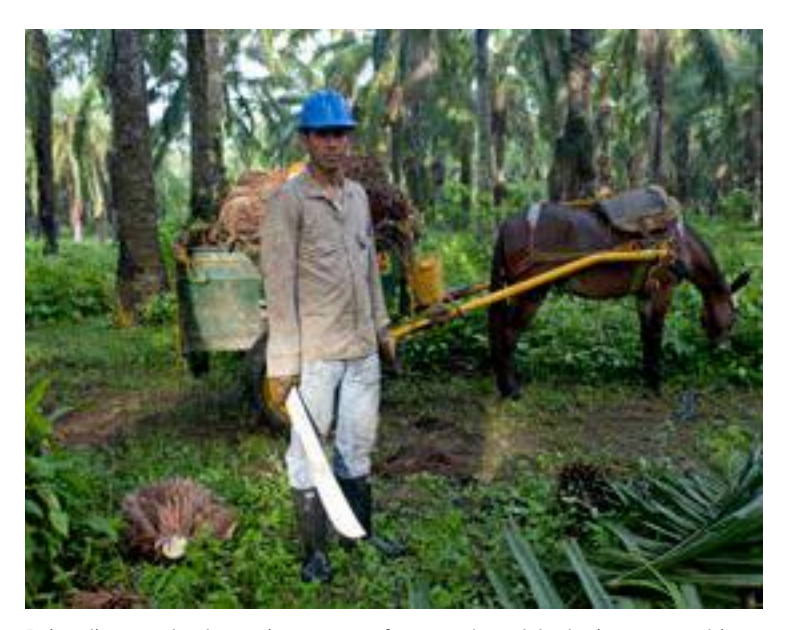
Palm oil extraction is another source of economic activity in the countryside.