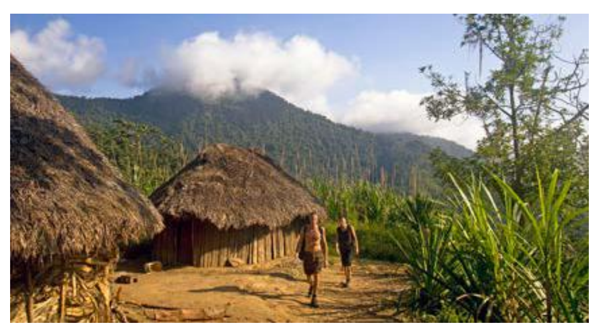
Lasting peace includes reparations to minorities such as the indigenous people who inhabit this village..