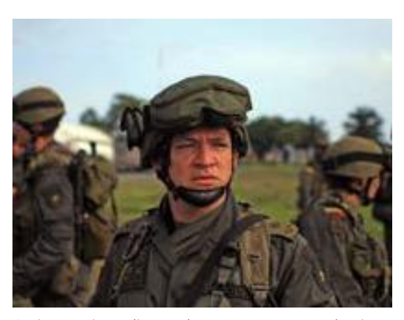
Anti-narcotics police work to uproot coca production.

Still, Colombia faces significant challenges, including a sharp rise in coca cultivation, attacks on social leaders and human rights defenders, the need to implement a complex peace accord amid political polarization, and the emergence of new illegal networks that benefit from drug trafficking, extortion, human trafficking, and illegal mining, and that seek to co-opt FARC territory, members, and criminal enterprises.9 The Colombian government will have to keep building its own capacities in previously forgotten and marginalized areas, largely populated by Afro-Colombian and indigenous communities. The United States has a direct stake in how Colombia resolves each of these challenges.