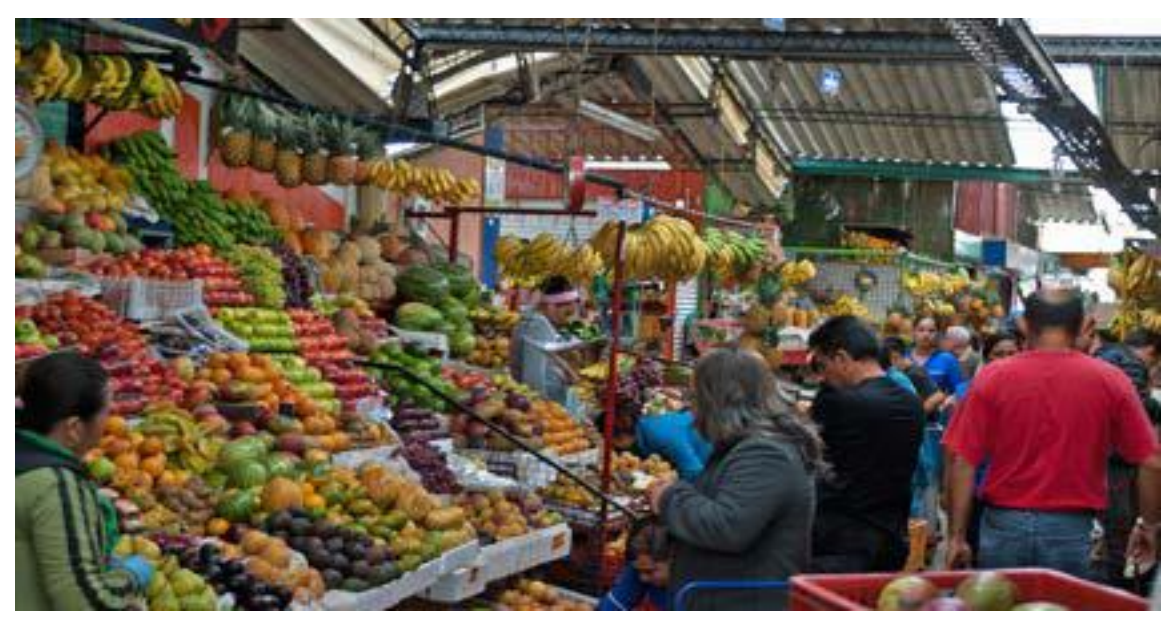
Colombia's exports have diversified far beyond the fruits and vegetables on display at this Bogotá market.

exporter in areas of vital strategic interest to the United States, particularly in Central America, <sup>13</sup> Mexico, Afghanistan, and African countries such as Nigeria, Kenya, and South Africa.<sup>14</sup> In 2013, for example, the US-Colombia Action Plan on Regional Security Cooperation delivered 39 capacity-building activities in four Central American countries, focused on areas such as asset forfeiture, investigations, polygraphs, and interdiction.<sup>15</sup> By 2016, this cooperation had expanded to include over 271 activities in six countries in Central America and the Caribbean.16