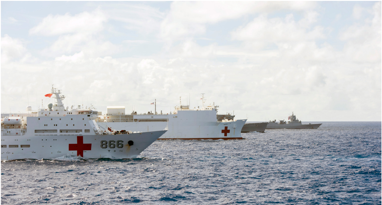
The Norwegian Navy frigate HNoMS Fridtjof Nansen (F310) underway with ships from the US Navy and the Chinese Navy during the RIMPAC exercise in the Pacific in 2014. Several other NATO members also participated in the Pacific exercise, including Canada, France, the Netherlands, and the United Kingdom. While far away from the Euro-Atlantic area, the Pacific will loom ever larger in the global maritime domain.

new corvettes. 13 Much of this new naval capacity is intended for the Northern Fleet, which operates in the Arctic, the Atlantic, and the Barents and Norwegian Seas. Russian amphibious capabilities will also be strengthened with the addition of four amphibious ships of either domestic or foreign design. 14 If the program is executed in full, Russia's naval power would almost double. However, it is far from clear whether the effort of rebuilding the Russian military will be fully realized, due to inefficiencies and corruption within the Russian procurement system and defense-industrial base. Furthermore, the currently low global prices for oil and gas, the mainstay of the Russian economy, could also reduce the resources available for Russian defense modernization over the long term. Still, the resources currently devoted to this effort are so large (roughly $125 billion in the case of naval modernization and expansion) that the program will surely produce considerable and useful output. 15