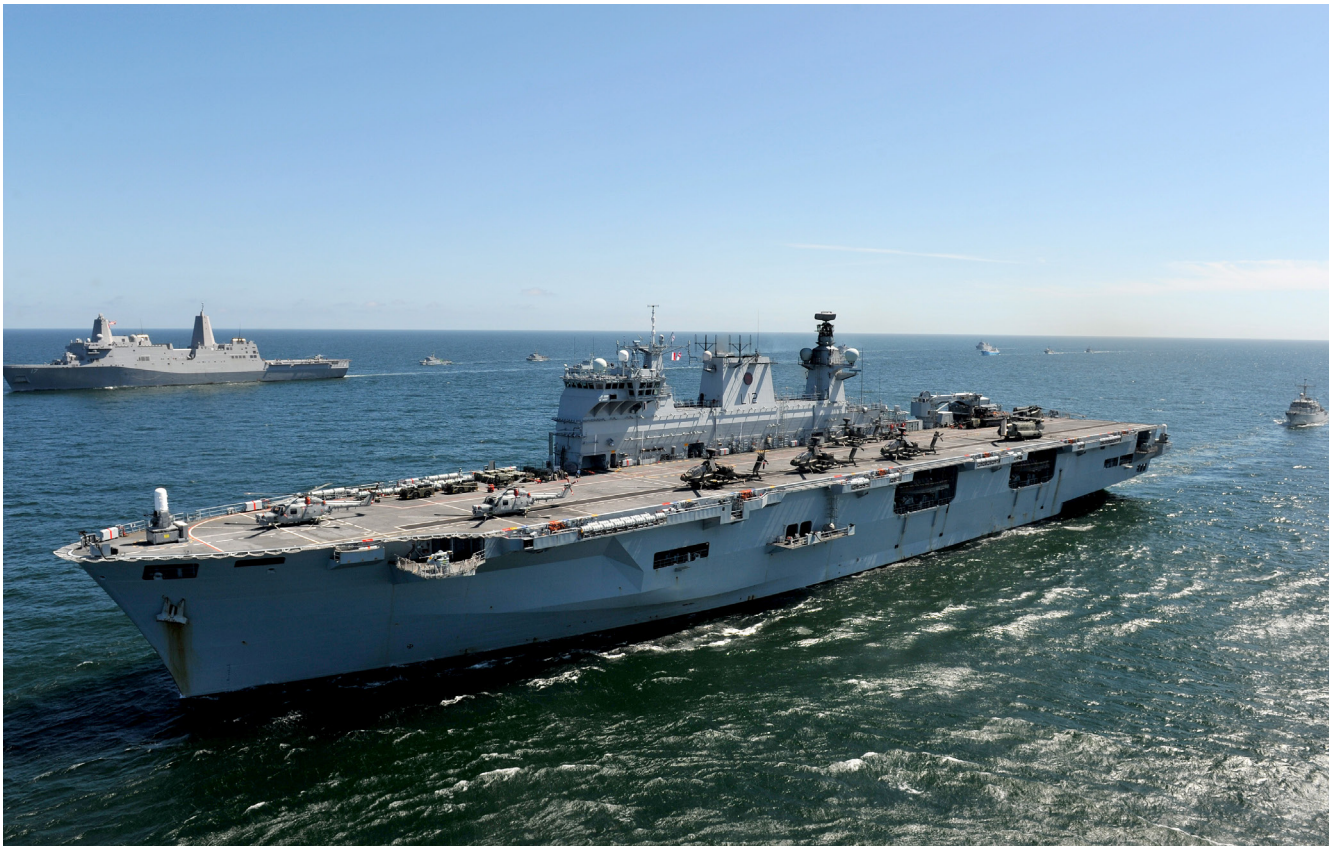
Allied warships underway in the Baltic Sea during the exercise BALTOPS 15 in early June of 2015.

NATO now has an opportunity to take the lead on the transatlantic community’s future security role in the maritime domain by setting its orientation, priorities, capabilities, and force structure to fully respond to an increasingly insecure and competitive maritime domain that remains vital to transatlantic peace and prosperity.