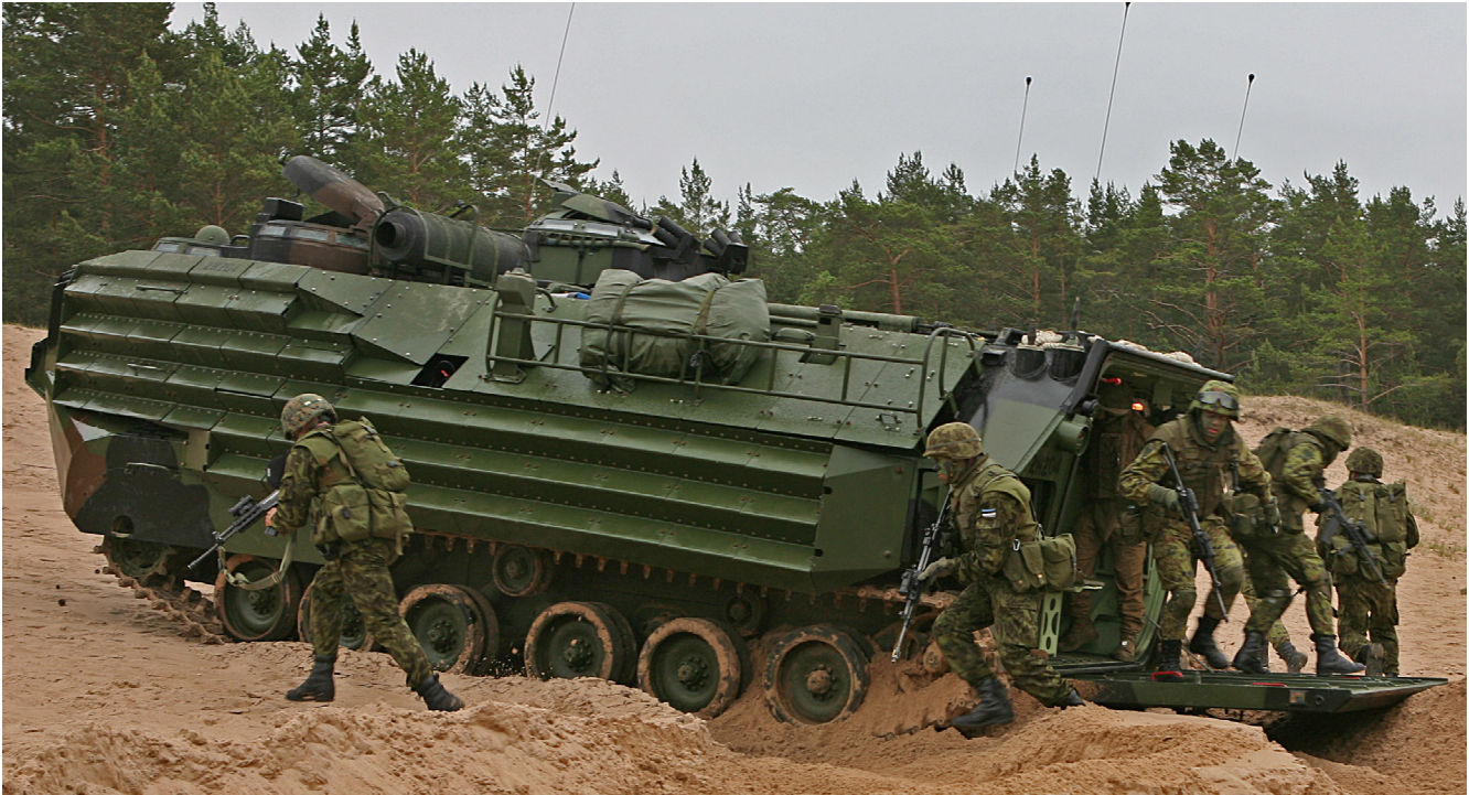
US Marines and Estonian soldiers land on the beach during an amphibious exercise outside Tallinn, Estonia.

increase the number of maritime-related projects under Smart Defense. For example, this could include areas such as joint maintenance of ships and naval aviation platforms and antisubmarine warfare training.