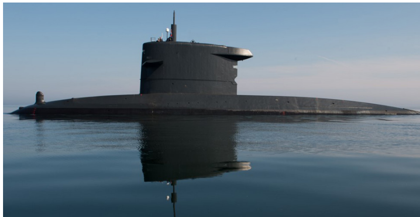
Dutch submarine HNLMS BRUINVIS at sea during the NATO exercise Dynamic Monarch in 2014. Submarine warfare and anti-submarine warfare is once again highly relevant for the changing European security environment and for NATO's collective defense and deterrence.

power across the Mediterranean. The Mediterranean will also remain the geopolitical crossroads of three continents: Europe, Africa, and Asia. Therefore, the Mediterranean is of increasing interest to emerging powers such as China, since the broader Mediterranean region is not only an important source of energy resources, but also a