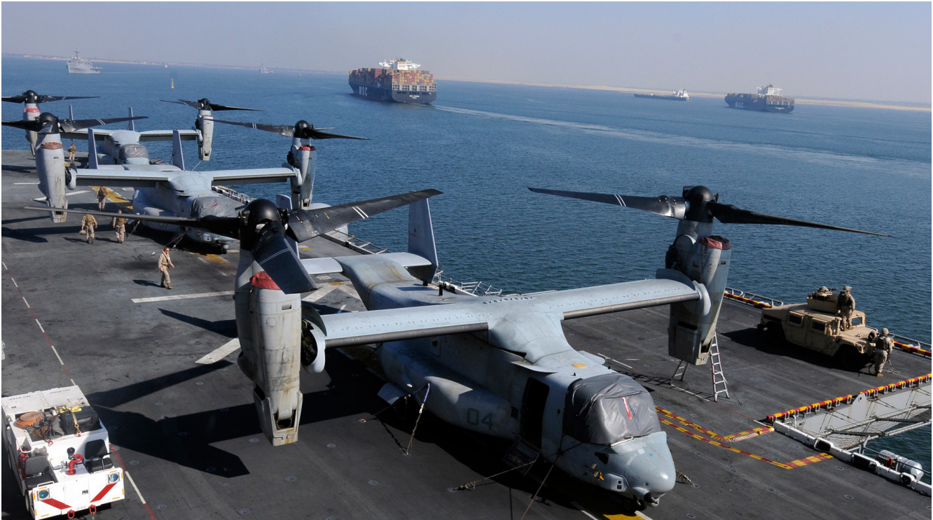
The USS Kearsarge transiting the Suez Canal, an important choke point for global commerce and for access to the Middle East.

and surveillance UAVs (which will likely one day be armed) aboard a carrier in 2013. This feat showcases the maturing of unmanned systems. Furthermore, technologies such as 3D printing (also known as additive manufacturing) could play an important role in naval underway logistics, thereby reducing the need for resupply and raising the level of underway readiness. 23 Finally, air-independent propulsion for conventional submarines is a significant leap in underwater endurance, which makes conventional submarines a harder target for antisubmarine warfare forces.