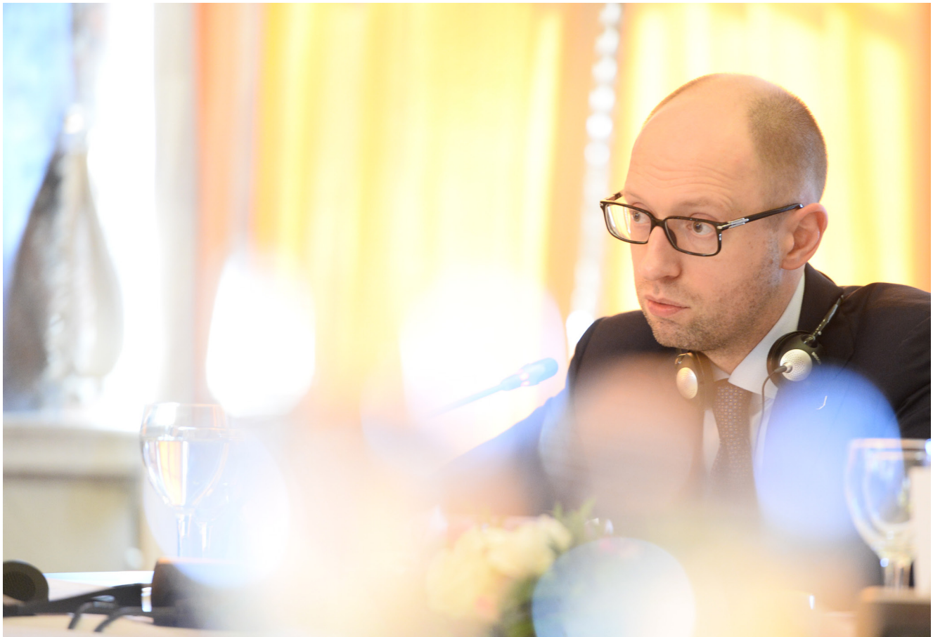
Ukrainian Prime Minister Arseniy Yatsenyuk.

Kyiv's new officers took to the streets on July 4, 2015, and are enjoying widespread approval from city residents. 23 Since then, new police forces also began work in Lviv and Odesa with plans underway to expand the new policing model to other regions of Ukraine.