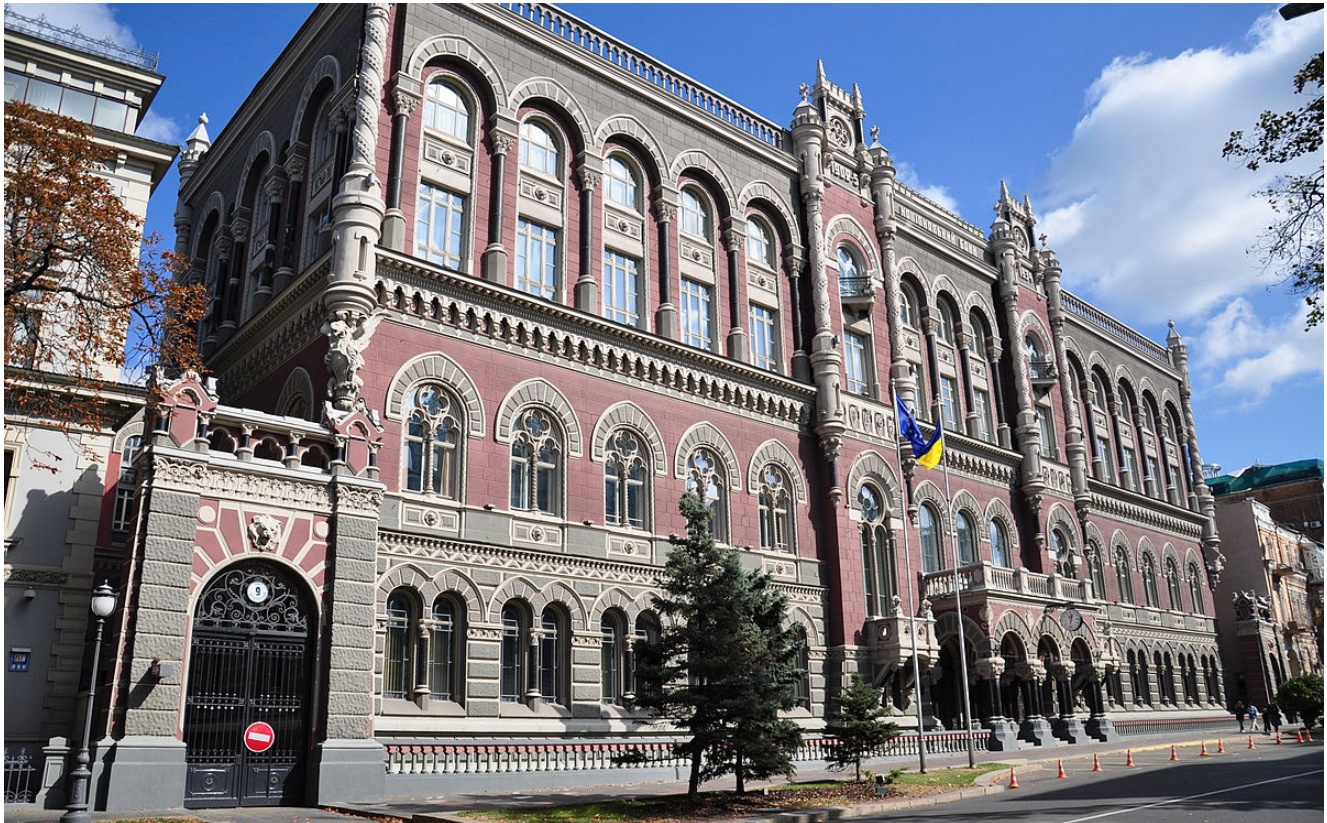
National Bank of Ukraine. Kyiv, Ukraine.

and adoption of the new gas market law in line with European practices. All three of these reforms are required by the IMF program. The experts also positively assessed the law deregulating business environment, increased transparency in public procurement and government's decision to liquidate Ukrecoresurs, a waste disposal company widely known as one of the most corrupt state-owned enterprises.